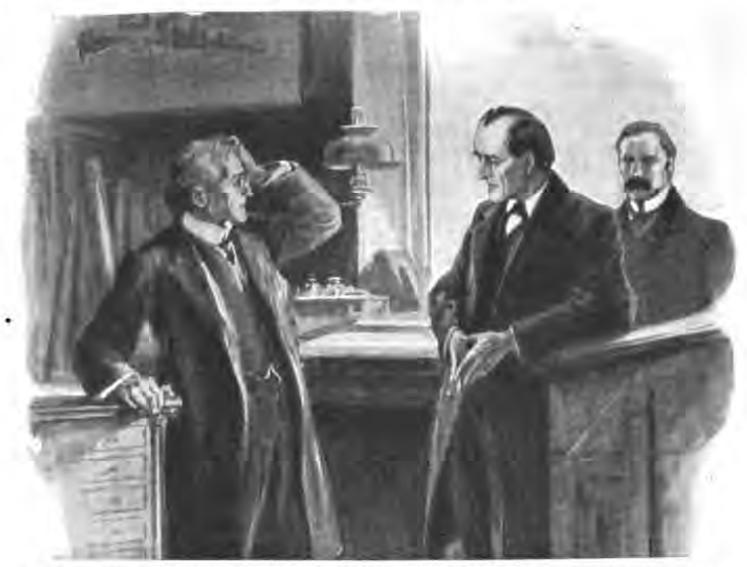
"DO YOU MEAN TO SAY THAT ANYONE HOLDING THESE THREE PAPERS, AND WITHOUT THE SEVEN OTHERS, COULD CONSTRUCT A BRUCE-PARTINGTON SUBMARINE?"

they could not make the boat. Of course, they might soon get over the difficulty."