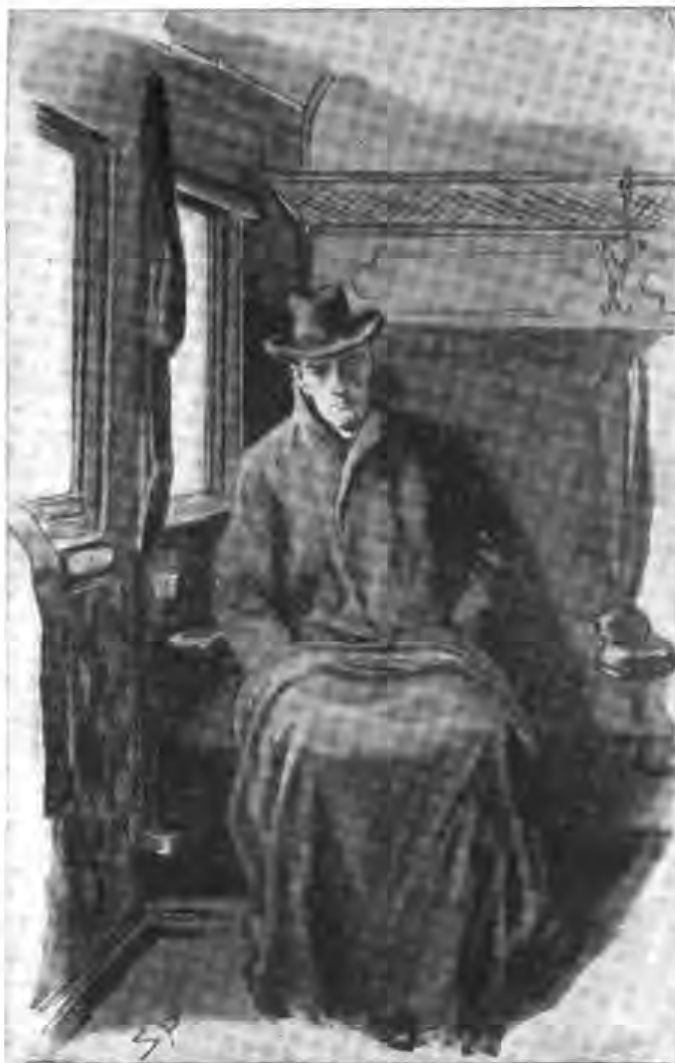
"I COULD SEE BY HOLMES'S FACE THAT HE WAS MUCH PUZZLED."

"Surely there are details in her story which,