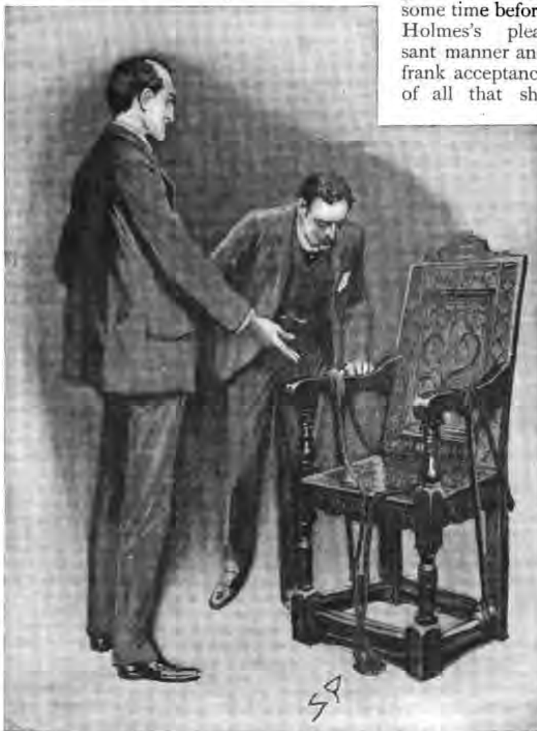
"LOOK AT THAT MARK ON THE SEAT OF THE OAKEN CHAIR!"

She was an interesting person, this stern Australian nurse. Taciturn, suspicious, ungracious, it took some time before Holmes's pleasant manner and frank acceptance of all that she