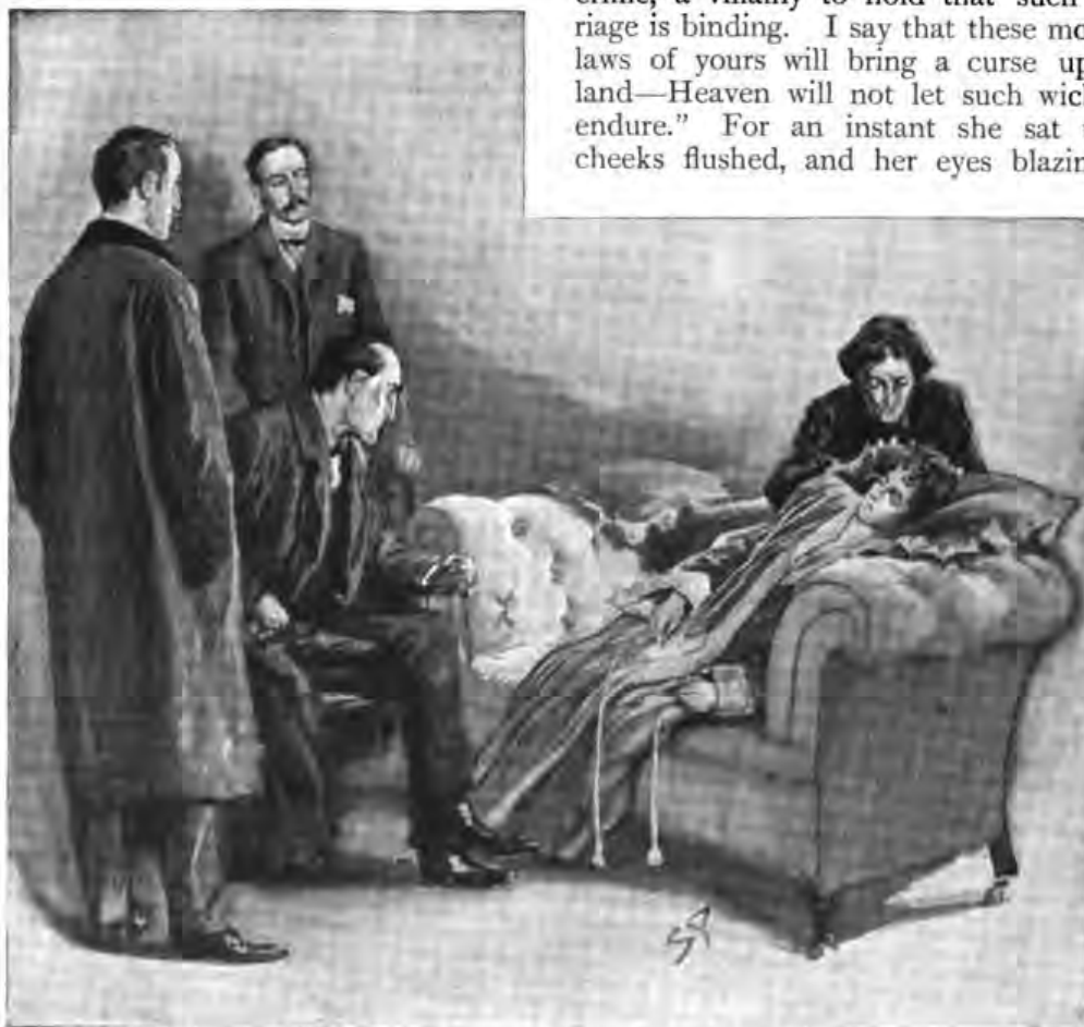
"I AM THE WIFE OF SIR EUSTACE BRACKENSTALL."

conventional atmosphere of South Australia, and this English life, with its proprieties and its primness, is not congenial to me. But the main reason lies in the one fact which is notorious to everyone, and that is that Sir Eustace was a confirmed drunkard. To be with such a man for an hour is unpleasant. Can you imagine what it means for a sensitive and high-spirited woman to be tied to him for day and night? It is a sacrilege, a crime, a villainy to hold that such a marriage is binding. I say that these monstrous laws of yours will bring a curse upon the land—Heaven will not let such wickedness endure." For an instant she sat up, her cheeks flushed, and her eyes blazing from