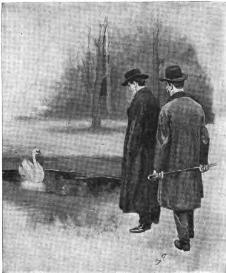
"HOLMES GAZED AT IT AND THEN PASSED ON."

then, at last, we made for Baker Street once more.