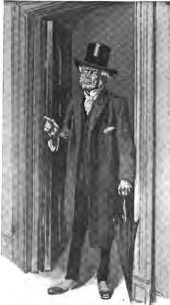
"ONE MOMENT, ONE MOMENT!" CRIED A QUERULOUS VOICE.