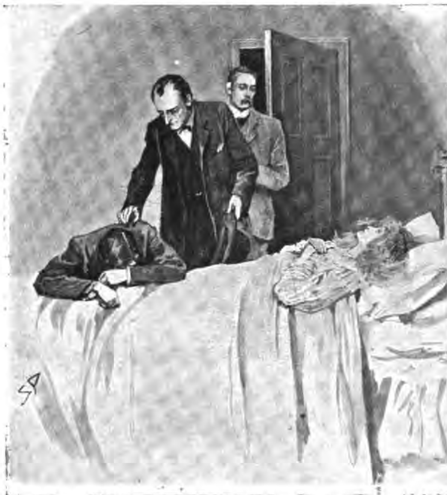
"HE NEVER LOOKED UP UNTIL HOLMES'S HAND WAS ON HIS SHOULDER."

I imagine, there is no breach of the law in this matter, you can absolutely depend upon my discretion and my co-operation in keeping the facts out of the papers."