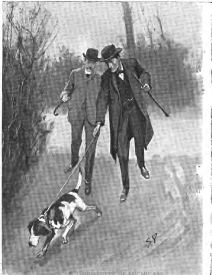
"WE WERE CLEAR OF THE TOWN AND HASTENING DOWN A COUNTRY ROAD."