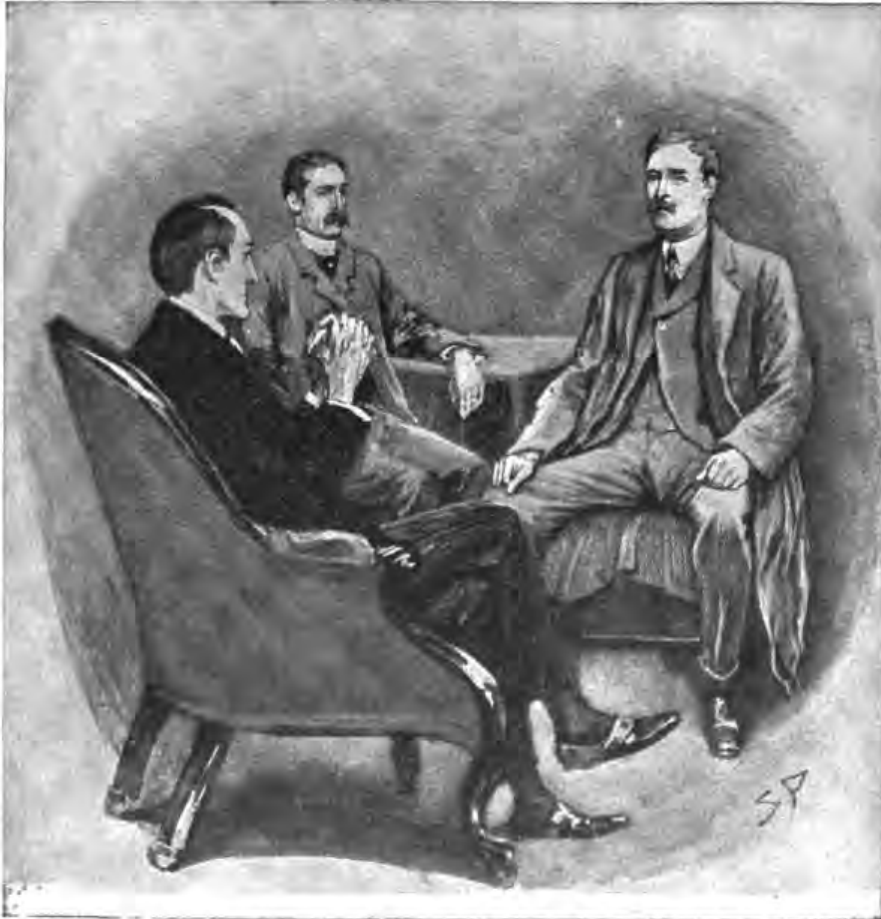
"WHY, MR. HOLMES, I THOUGHT YOU KNEW THINGS," SAID HE.

Holmes shook his head good-humouredly. "Great Scot!" cried the athlete. "Why,