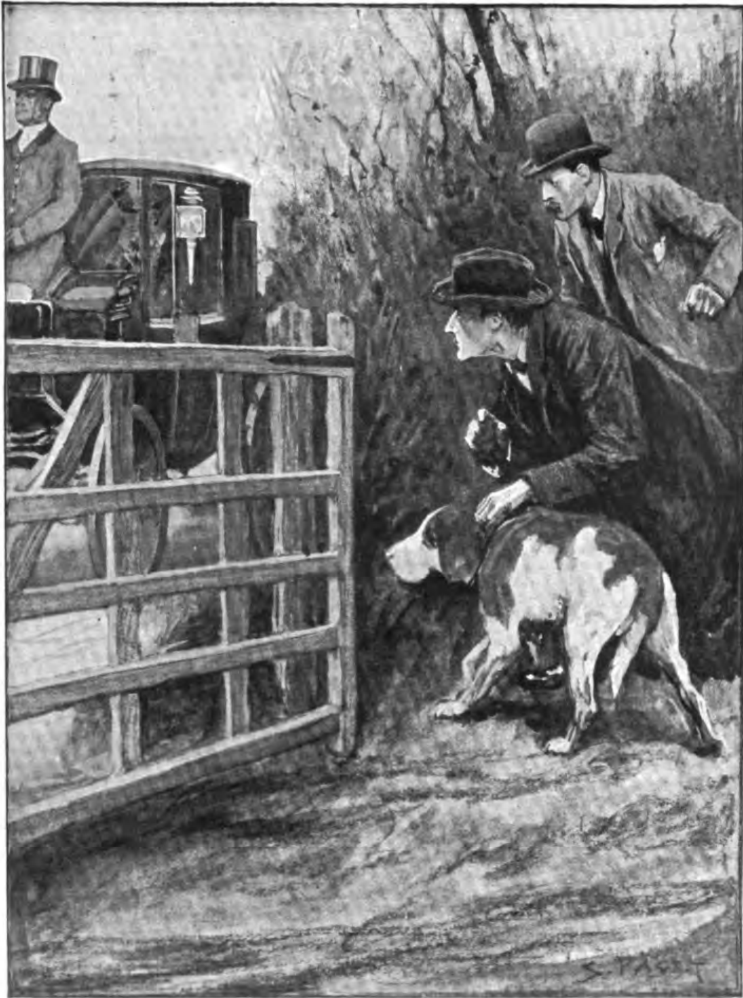
"THE CARRIAGE RATTLED PAST."