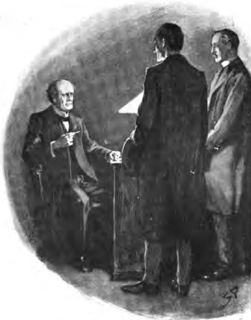
"HE LOOKED UP WITH NO VERY PLEASSED EXPRESSION ON HIS DOUR FEATURES."

Holmes popped a sheet of paper before the doctor's eyes. "Then perhaps you will explain this receipted bill for thirteen guineas, paid by Mr. Godfrey Staunton last month to Dr. Leslie Armstrong of Cambridge. I