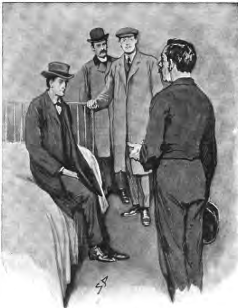
"DID YOU TAKE ANY MESSAGES TO MR. STAUNTON?"

"It is a pity he did not write in pencil," said he, throwing them down again with a shrug of disappointment. "As you have no doubt frequently observed, Watson, the