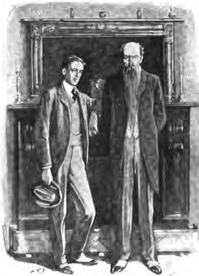
"BESIDE HIM STOOD A VERY YOUNG MAN."

"This case grows upon me, Watson," said he. "There are decidedly some points of interest in connection with it. In this early stage I want you to realize those geographical features which may have a good deal to do with our investigation.