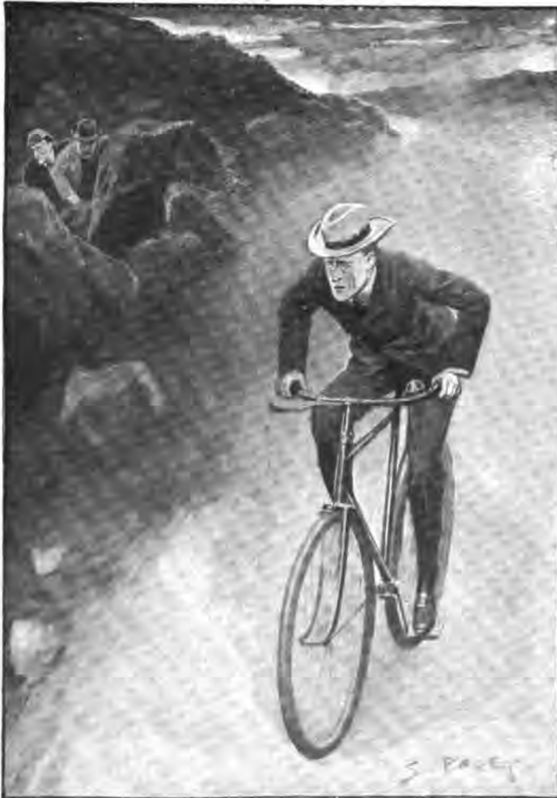
"THE MAN FLEW PAST US ON THE ROAD."

"Come, my friend," said he, "our day's work has been quite long enough. I think that we have gathered all that we can. It's a long walk to the school, and the sooner we get started the better."