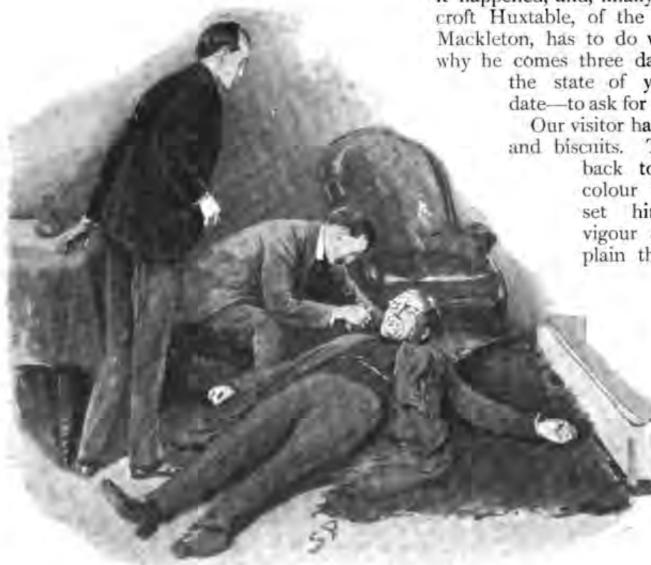
"THE HEAVY WHITE FACE WAS SEAMED WITH LINES OF TROUBLE."

Carston'—dear me, what a list! 'Lord Lieutenant of Hallamshire since 1900. Married Edith, daughter of Sir Charles Appledore, 1888. Heir and only child, Lord Saltire. Owns about two hundred and fifty thousand acres. Minerals in Lancashire and Wales. Address: Carlton House Terrace; Holderness Hall, Hallamshire; Carston Castle, Bangor, Wales. Lord of the Admiralty, 1872; Chief Secretary of State for——' Well, well, this man is certainly one of the greatest subjects of the Crown!"