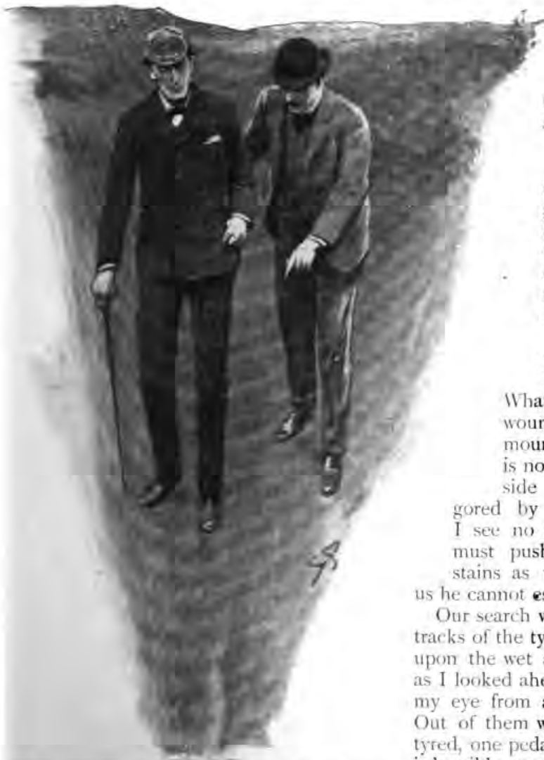
"AN IMPRESSION LIKE A FINE BUNDLE OF TELEGRAPH WIRES RAN DOWN THE CENTRE OF IT."

We continued our systematic survey of the edge of the sodden portion of the moor, and soon our perseverance was gloriously rewarded. Right across the lower part of the bog lay a miry path. Holmes gave a cry of delight as he approached it. An impression like a fine bundle of telegraph wires ran down the centre of it. It was the Palmer tyre.