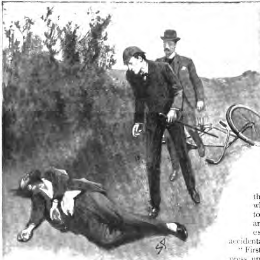
"THERE LAY THE UNFORTUNATE RIDER."

"Now I come to the critical part of my argument. The natural action of a man in pursuing a little boy would be to run after