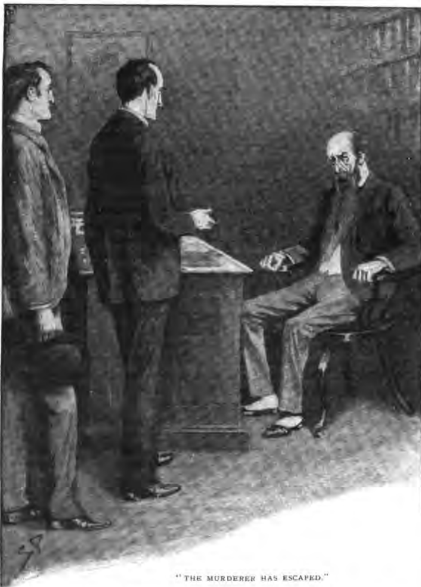
"THE MURDERER HAS ESCAPED."

else," said he. "At least we may take counsel how far we can minimize this hideous scandal."