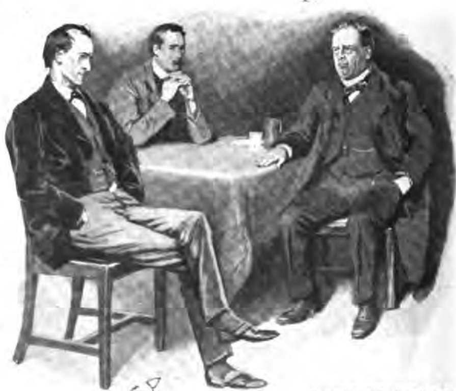
"WHAT IS THE THEORY IN YOUR MIND?"