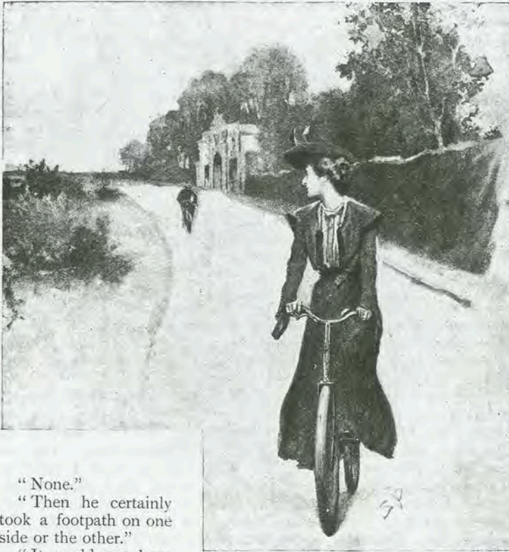
"I SLOWED DOWN MY MACHINE."