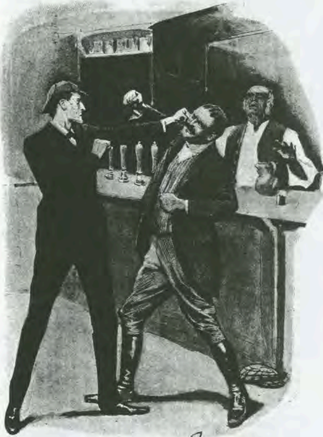
"A STRAIGHT LEFT AGAINST A SLOGGING RUFFIAN."

A rainy night had been followed by a glorious morning, and the heath-covered country-side with the glowing clumps of flowering gorse seemed all the more beautiful to eyes which were weary of the duns and drabs and slate-greys of London. Holmes and I walked along the broad, sandy road