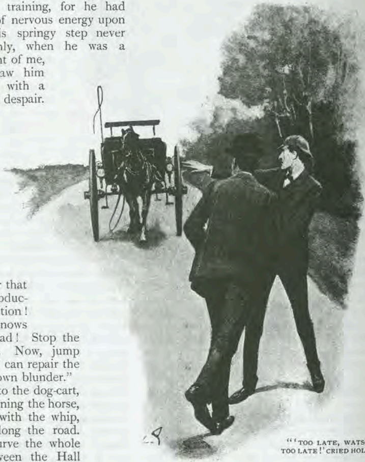
"TOO LATE, WATSON; TOO LATE!" CRIED HOLMES.

Holmes threw the reins into my lap and sprang down from the cart.