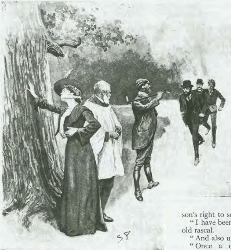
"AS WE APPROACHED, THE LADY STAGGERED AGAINST THE TRUNK OF THE TREE."