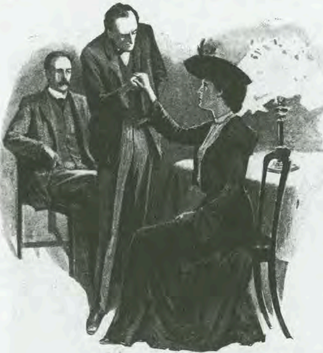
"MY FRIEND TOOK THE LADY'S UNGLOVED HAND AND EXAMINED IT."

obvious that it is music. You observe the spatulate finger-end, Watson, which is common to both professions? There is a spirituality about the face, however—he gently turned it towards the light—"which the typewriter does not generate. This lady is a musician."