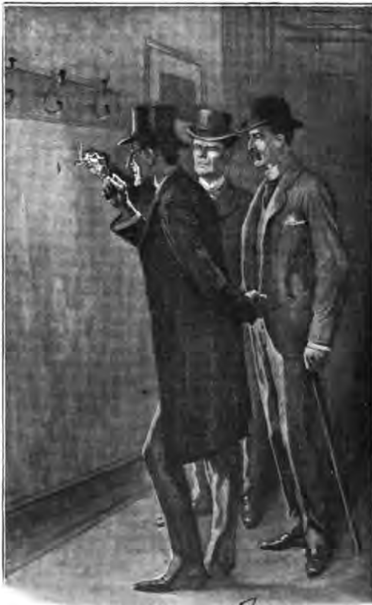
"LOOK AT THAT WITH YOUR MAGNIFYING GLASS, MR. HOLMES."

"This is where young McFarlane must have come out to get his hat after the crime was done," said he. "Now, look at this." With dramatic suddenness he struck a match and by its light exposed a stain of blood upon the whitewashed wall. As he held the