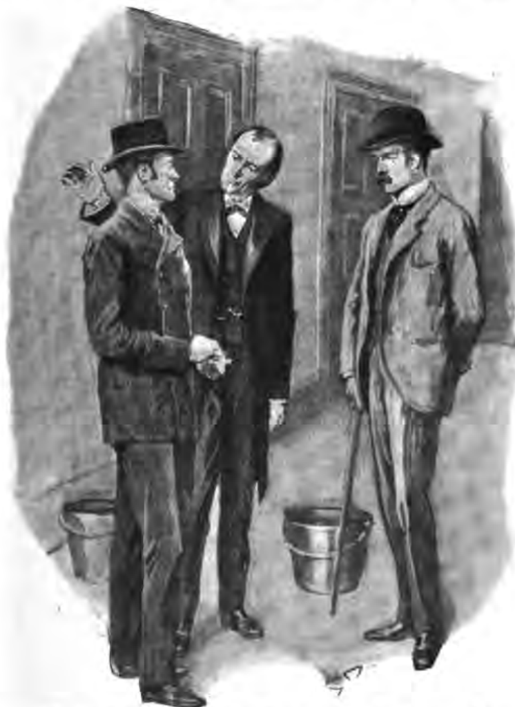
"HOLMES SMILED AND CLAPPED LESTRADE UPON THE SHOULDER."

"Instead of being ruined, my good sir, you will find that your reputation has been enormously enhanced. Just make a few