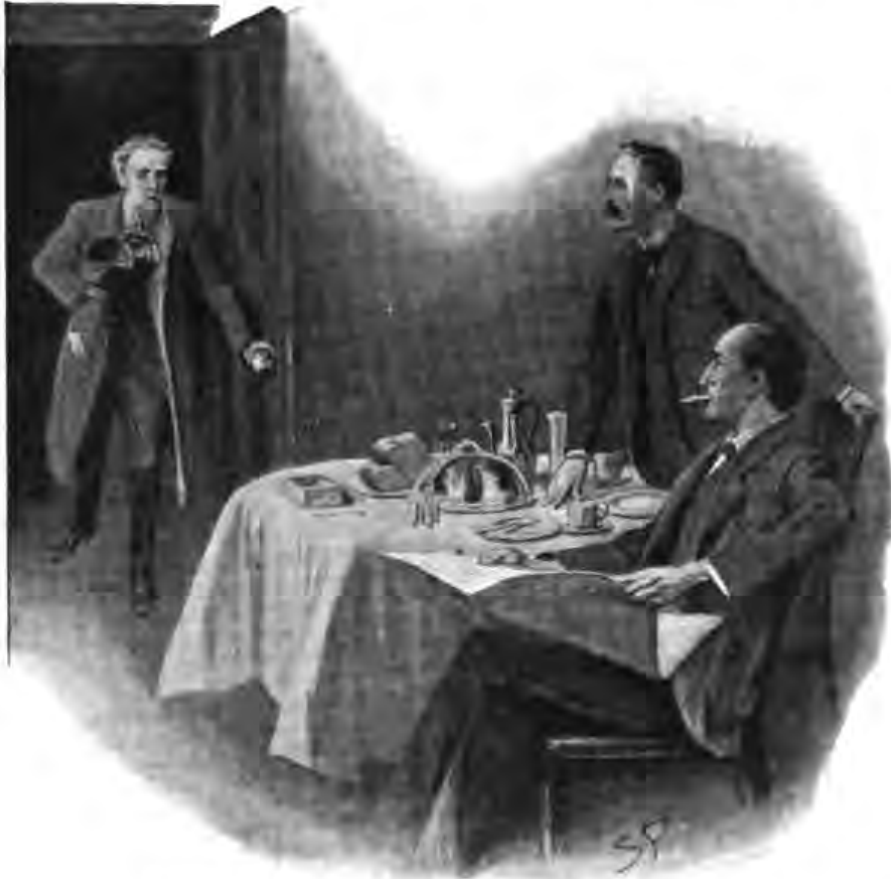
"A WILD-EYED AND FRANTIC YOUNG MAN BURST INTO THE ROOM."

"I'm sorry, Mr. Holmes," he cried. "You mustn't blame me. I am nearly mad. Mr. Holmes, I am the unhappy John Hector McFarlane."