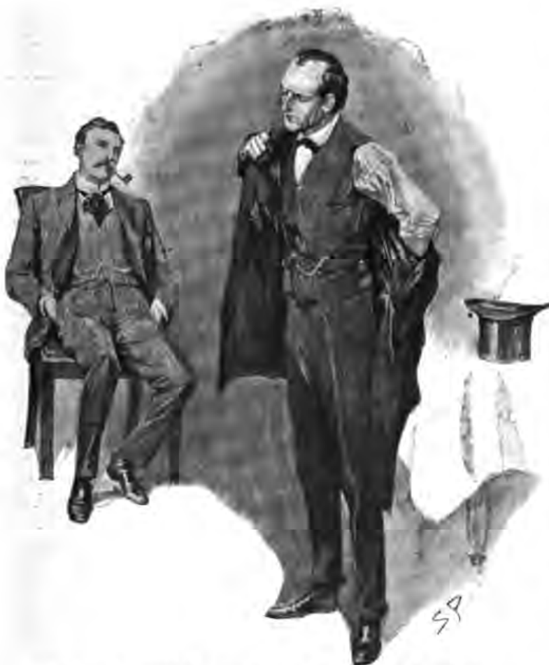
"MY FIRST MOVEMENT, WATSON," SAID HE, "MUST BE IN THE DIRECTION OF BLACKHEATH."

"Because we have in this case one singular incident coming close to the heels of another singular incident. The police are making the mistake of concentrating their attention upon the second, because it happens to be the one which is actually criminal. But it is evident to me that the logical way to approach the case is to begin by trying to throw some light upon the first incident—the curious will, so suddenly made, and to so unexpected an heir. It may do something to simplify what followed. No, my dear fellow, I don't think you can help me. There is no prospect of danger, or I should not dream of stirring out without you. I trust that when I see you in the evening I will be able to report that I have been able to do something for this unfortunate