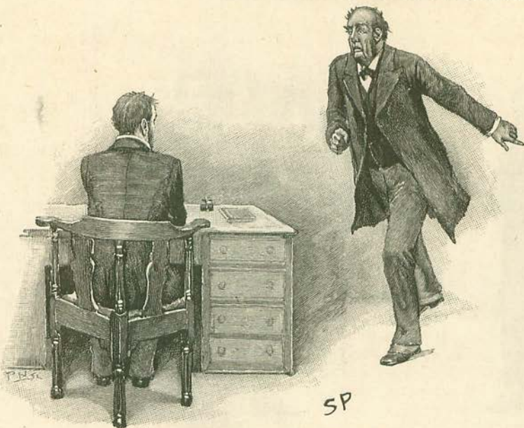
"HE BURST INTO MY CONSULTING-ROOM."

waiting-room had for some unknown reason, while I was busy with the other, ascended to the room of my resident patient. Nothing had been touched or taken, but there were the footprints to prove that the intrusion was an undoubted fact.