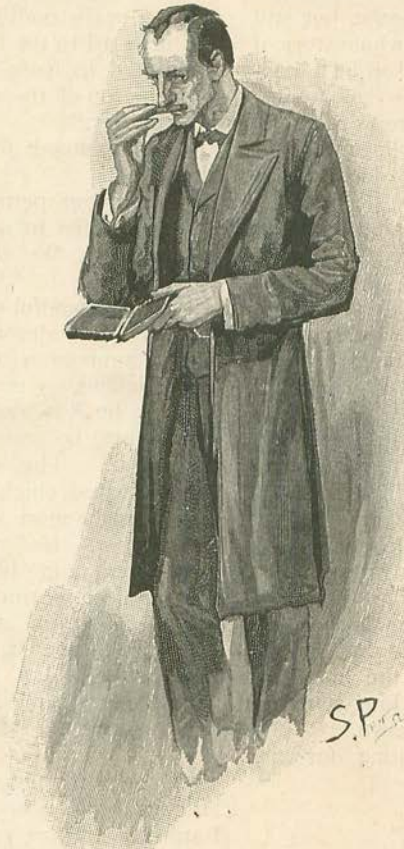
"HOLMES OPENED IT AND SMELLED THE SINGLE CIGAR WHICH IT CONTAINED."

"He has played a not unimportant part in this drama," said he. "The three men having ascended the stair, which they did on tiptoe, the elder man first, the younger man