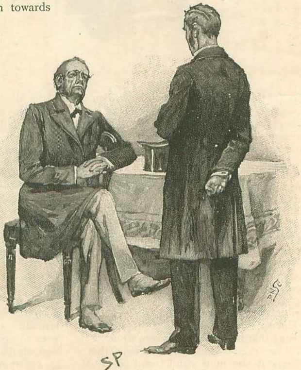
"I STARED AT HIM IN ASTONISHMENT."

"This was the strange proposal, Mr. Holmes, with which the man Blessington approached me. I won't weary you with the account of how we bargained and negotiated. It ended in my moving into the house next Lady Day and starting in practice on very much the same conditions as he had suggested. He came himself to live with me in the character of a resident patient. His heart was weak, it appears, and he needed constant medical supervision. He turned the two best rooms on the first floor into a sitting-room and bedroom for himself. He was a man of singular habits, shunning company and very seldom going out. His life was irregular, but in one respect he was regularity itself. Every evening at the same hour he walked into the consulting-room, examined the books, put down five and three-pence for every guinea that I had earned, and carried the rest off to the strong box in his own room.