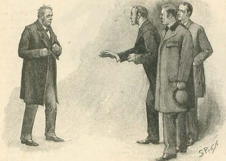
"IN HIS HAND HE HELD A PISTOL."

that. You can hardly expect me to answer that, Mr. Holmes."