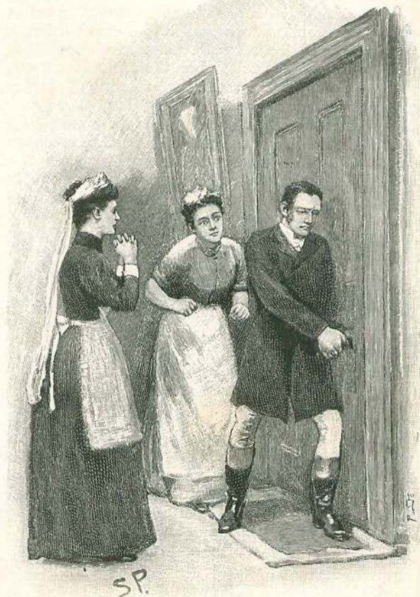
"THE COACHMAN RUSHED TO THE DOOR."

"Before examining the room I cross-questioned the servants, but only succeeded in eliciting the facts which I have already stated. One other detail of interest was remembered by Jane Stewart, the housemaid. You will remember that on hearing the sound of the quarrel she descended and returned with the other servants. On that first occasion, when she was alone, she says that the voices of her master and mistress were sunk so low that she could hear hardly anything, and judged by their tones, rather than their words, that they had fallen out. On my pressing her, however, she remem-