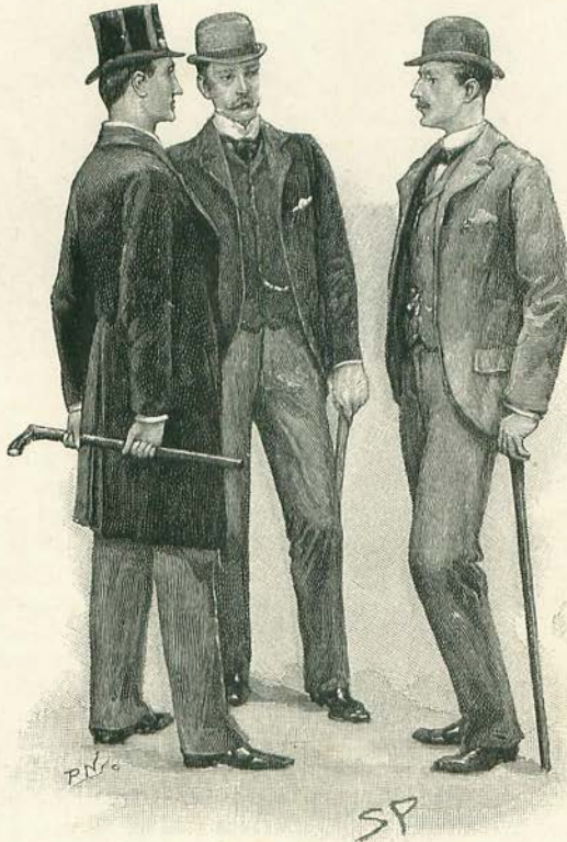
"IT WAS QUITE A SIMPLE CASE AFTER ALL."

"Yes, David strayed a little occasionally, you know, and on one occasion in the same direction as Sergeant James Barclay. You remember the small affair of Uriah and Bathsheba. My Biblical knowledge is a trifle rusty, I fear, but you will find the story in the first or second of Samuel."