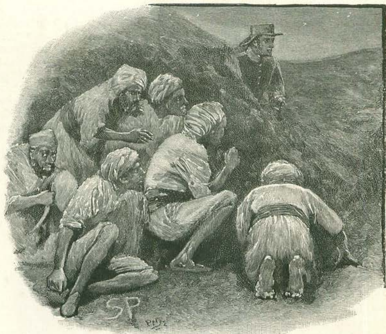
"I WALKED RIGHT INTO SIX OF THEM."

"Well, there's no need for me to dwell on that part of it. You know now what James Barclay was capable of. Bhurtee was relieved by Neill next day, but the rebels took me away with them in their retreat, and it was many a long year before ever I saw a white face again. I was tortured, and tried to get away, and was captured and tortured again. You can see for yourselves the state in which I was left. Some of them that fled into Nepaul took me with them, and then afterwards I was up past Darjeeling. The hill-folk up there murdered the rebels who had me, and I became their slave for a time until I escaped, but instead of going south I had to go north, until I found myself among the Afghans. There I wandered about for many a year, and at last came back to the Punjab, where I lived mostly among the natives, and picked up a living by the conjuring tricks that I had learned. What use was it for me, a wretched cripple, to go back to England, or to make myself known to my old comrades? Even my wish for revenge would not make me do that. I had