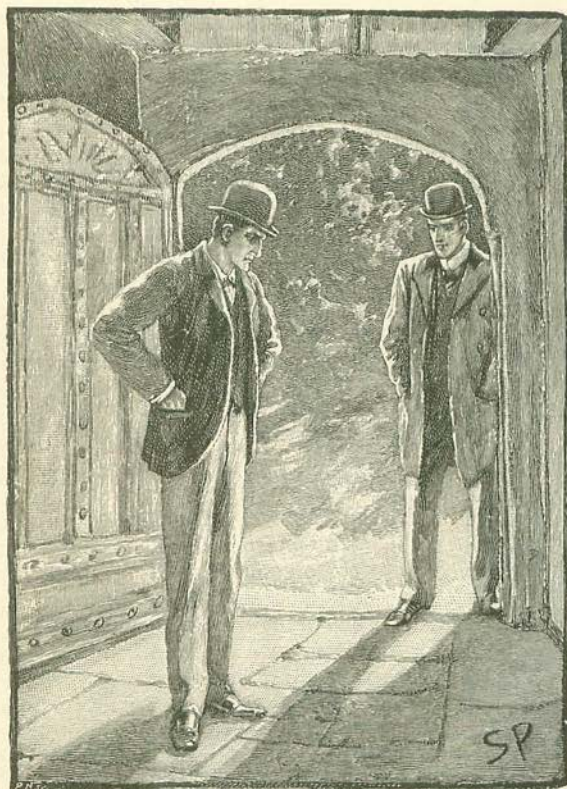
"THIS WAS THE PLACE INDICATED."

setting sun shone full upon the passage floor, and I could see that the old foot-worn grey stones, with which it was paved, were firmly cemented together, and had certainly not been moved for many a long year. Brunton had not been at work here. I tapped upon the floor, but it sounded the same all over, and there was no sign of any crack or crevice. But fortunately, Musgrave, who had begun to appreciate the meaning of my proceedings, and who was now as excited as myself, took out his manuscript to check my calculations.