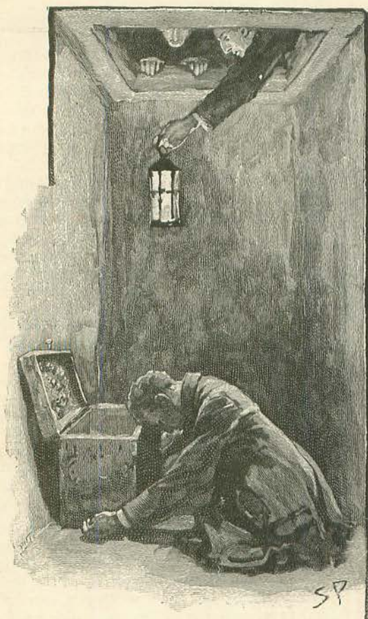
"IT WAS THE FIGURE OF A MAN."

"I confess that so far, Watson, I had been disappointed in my investigation. I had reckoned upon solving the matter when once I had found the place referred to in the Ritual; but now I was there, and was apparently as far as ever from knowing what it was which the family had concealed with such elaborate precautions. It is true that I had thrown a light upon the fate of Brunton, but now I had to ascertain how that fate had come upon him, and what part had been played in the matter by the woman who had disappeared. I sat down upon a keg in the corner and thought the whole matter carefully over.