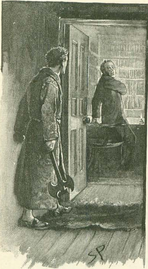
"HE SPRANG TO HIS FEET."

any importance at all, but simply a copy of the questions and answers in the singular old observance called the Musgrave Ritual. It is a sort of ceremony peculiar to our family, which each Musgrave for centuries past has gone through upon his coming of age—a thing of private interest, and perhaps of some little importance to the archæologist, like our own blazonings and charges, but of no practical use whatever.