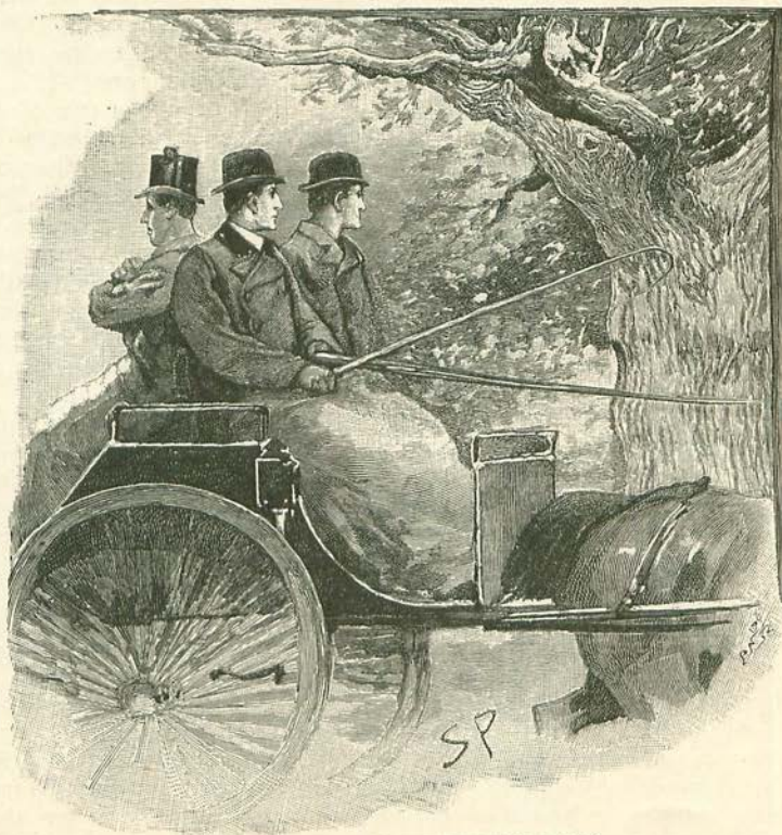
"IT HAS A GIRTH OF TWENTY-THREE FEET."

"I was already firmly convinced, Watson, that there were not three separate mysteries here, but one only, and that if I could read the Musgrave Ritual aright, I should hold in my hand the clue which would lead me to the truth concerning both the butler Brunton and the maid Howells. To that, then, I turned all my energies. Why should this servant be so anxious to master this old