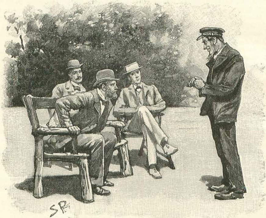
“‘HUDSON IT IS, SIR,’ SAID THE SEAMAN.”

kitchen. Mr. Trevor mumbled something to us about having been shipmates with the man when he was going back to the diggings, and then, leaving us on the lawn, he went indoors. An hour later, when we entered the house we found him stretched dead drunk upon the dining-room sofa. The whole incident left a most ugly impression upon my mind, and I was not sorry next day to leave Donnithorpe behind me, for I felt that my presence must be a source of embarrassment to my friend.