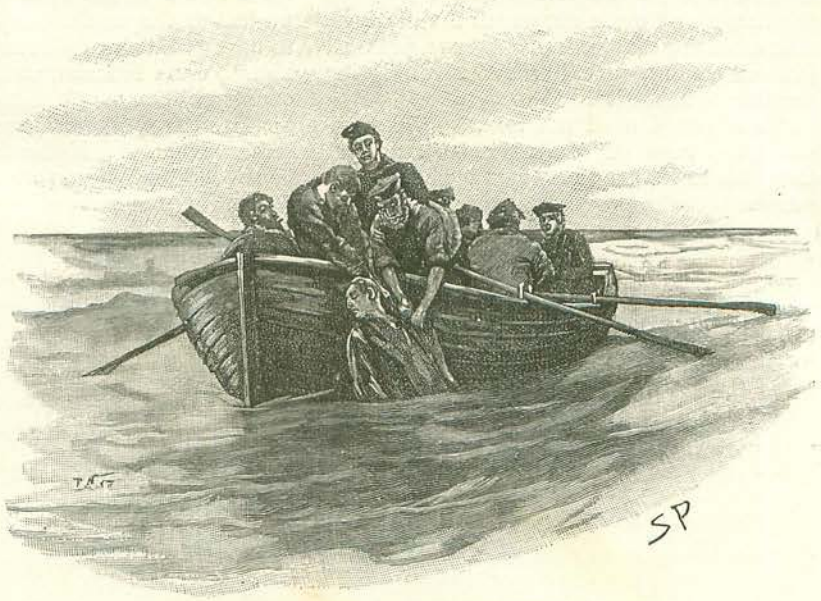
WE PULLED HIM ABOARD THE BOAT."

"It seemed that after we had left, Prendergast and his gang had proceeded to put to death the five remaining prisoners: the two warders had been shot and thrown overboard,