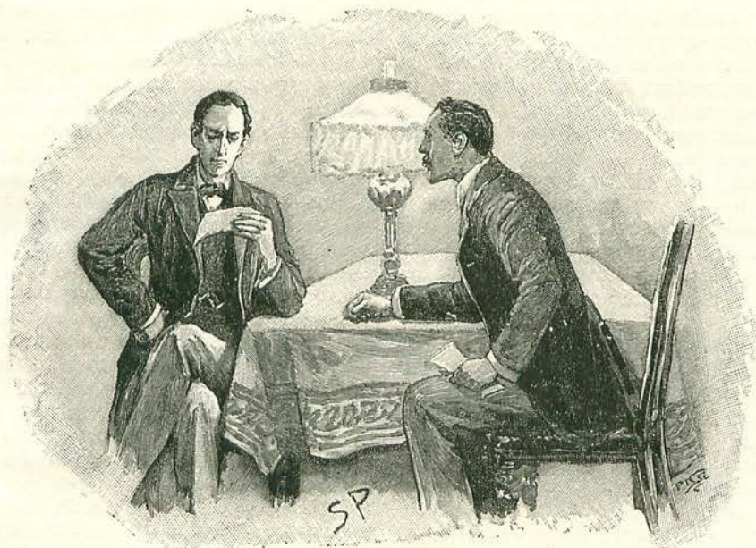
"THE KEY OF THE RIDDLE WAS IN MY HANDS."

"The game is up. Hudson has told all. Fly for your life."