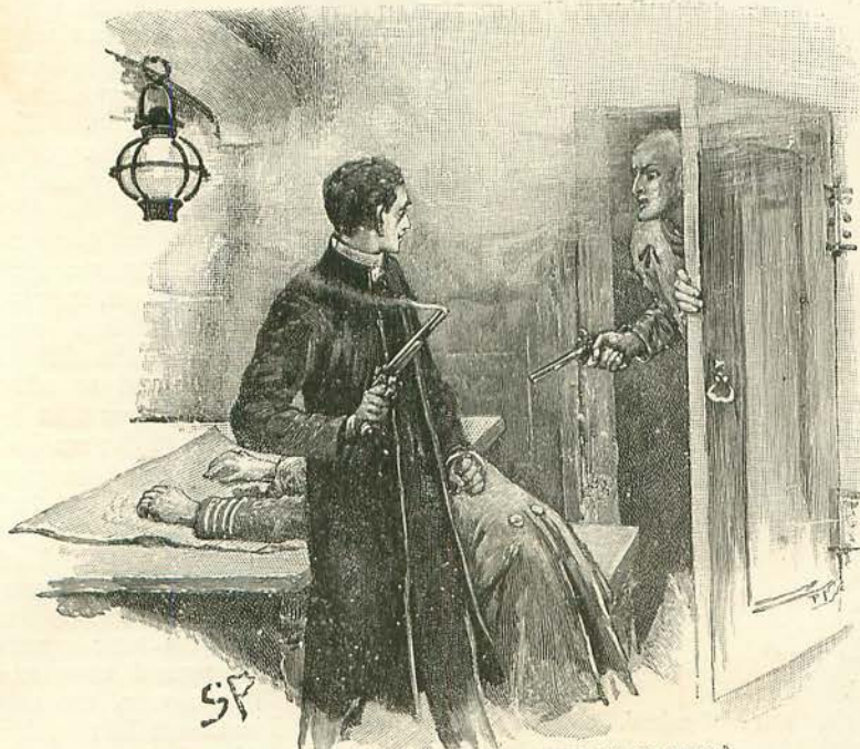
* THE CHAPLAIN STOOD WITH A SMOKING PISTOL IN HIS HAND.*

We got on them before they could load, and they stood to it like men, but we had the upper hand of them, and in five minutes it was all over. My God! was there ever a slaughter-house like that ship? Prendergast was like a raging devil, and he picked the soldiers up as if they had been children and threw them overboard, alive or dead. There was one sergeant that was horribly wounded, and yet kept on swimming for a surprising time, until