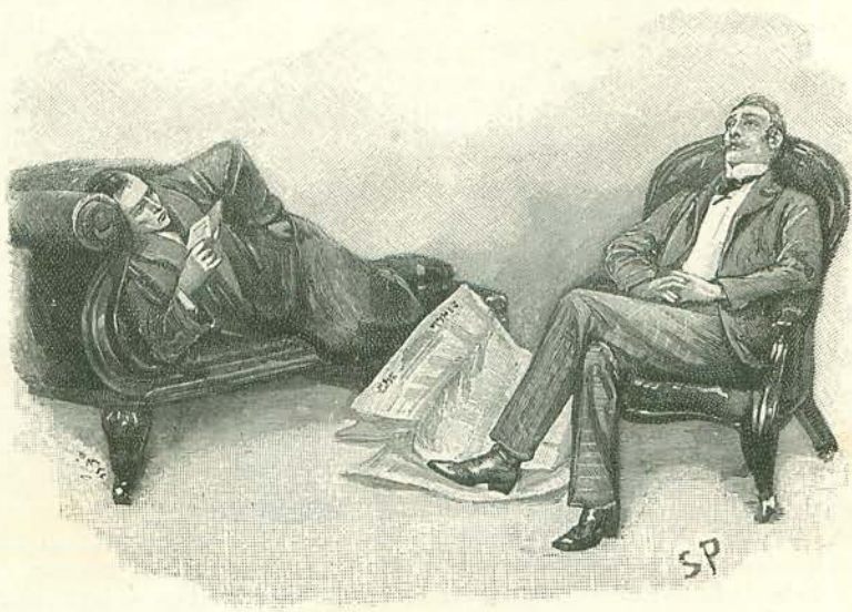
"I FELL INTO A BROWN STUDY."

"You are right, Watson," said he. "It does seem a most preposterous way of settling a dispute."