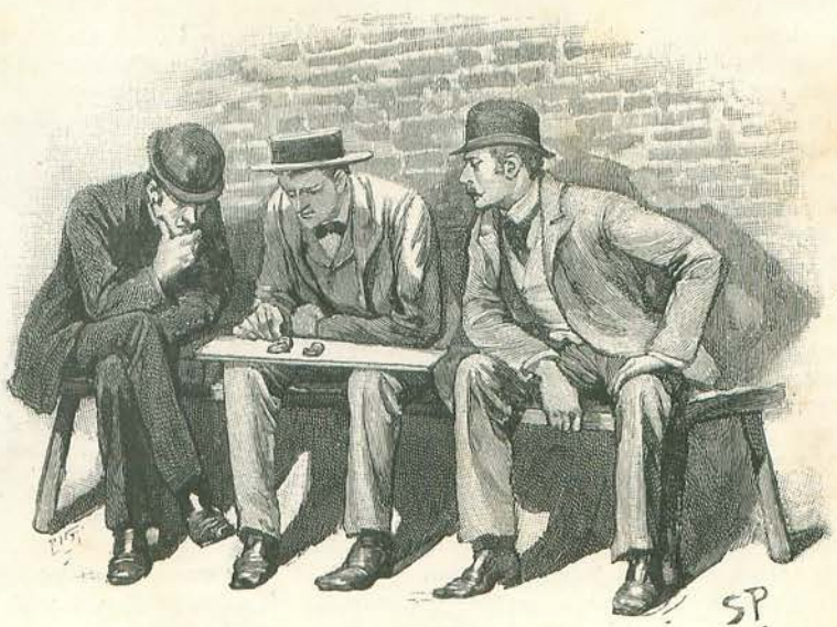
"HE EXAMINED THEM MINUTELY."

He took out the two ears as he spoke, and laying a board across his knees, he examined them minutely, while Lestrade and I, bending forward on each side of him, glanced