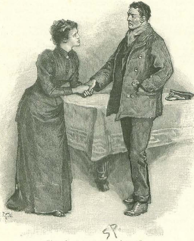
"'THAT'S ALL RIGHT, MY LASS,' SAID I."

"It was only a little thing, too. I had come into the parlour unexpected, and as I walked in at the door I saw a light of welcome on my wife's face. But as she saw who it was it faded again, and she