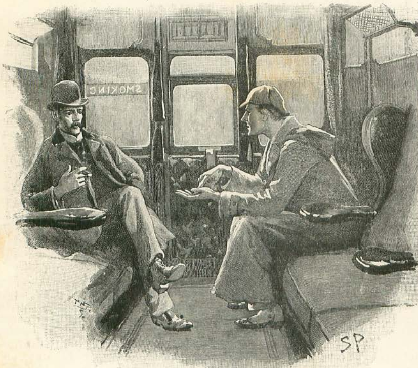
"HOLMES GAVE ME A SKETCH OF THE EVENTS."

John Straker, is a retired jockey, who rode in Colonel Ross's colours before he became too heavy for the weighing chair. He has served the Colonel for five years as jockey, and for seven as trainer, and has always shown himself to be a zealous and honest servant. Under him were three lads, for the establishment was a small one, containing only four horses in all. One of these lads sat up each night in