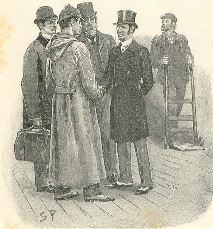
"I AM DELIGHTED THAT YOU HAVE COME DOWN, MR. HOLMES."

"Undoubtedly. He has neither a knife nor any sign of a wound. The evidence against him is certainly very strong. He had a great interest in the