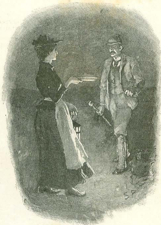
"A MAN APPEARED OUT OF THE DARKNESS."

"What business have you here?' asked the lad.