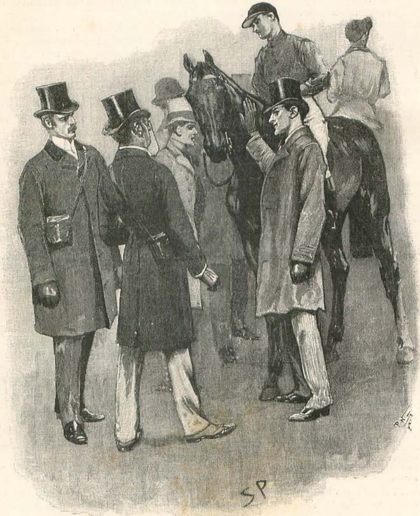
HE LAID HIS HAND UPON THE GLOSSY NECK.

crime, Colonel," said he; "the real murderer is standing immediately behind you!"