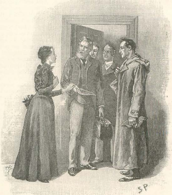
"HAVE YOU FOUND THEM?" SHE PANTED.

"Dear me; why, I could have sworn to it. You wore a costume of dove-coloured silk, with ostrich feather trimming."