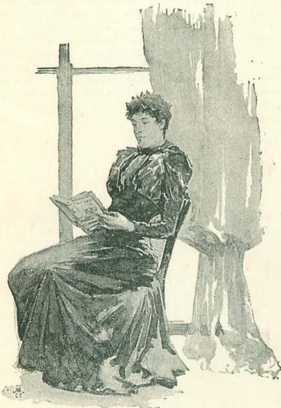
"I READ FOR ABOUT TEN MINUTES."

"I did as I was told, and at the same instant Mrs. Rucastle drew down the blind. That was a week ago, and from that time I have not sat again in the window, nor have