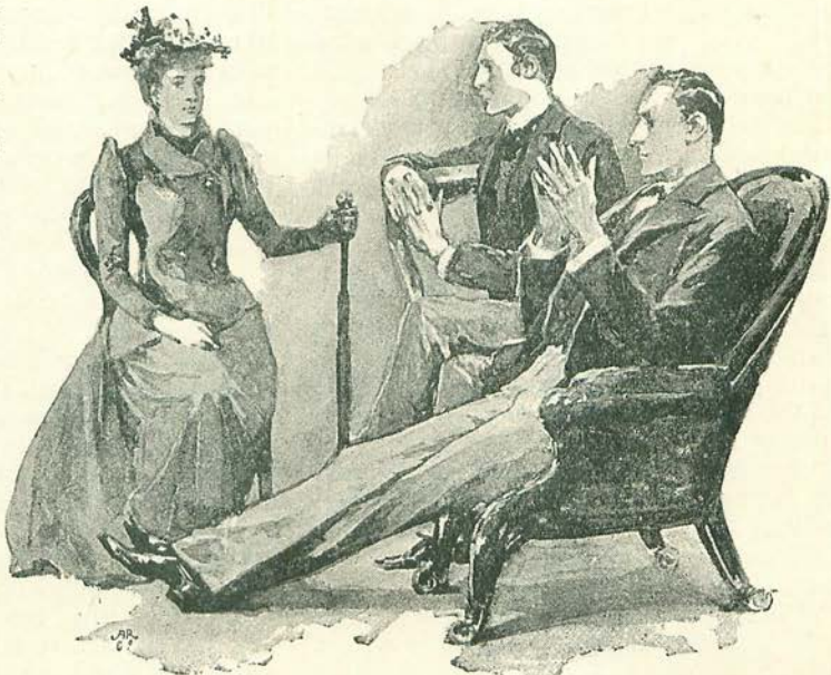
“HOLMES SHOOK HIS HEAD GRAVELY.”

Holmes shook his head gravely. “It would cease to be a danger if we could define it,” said he. “But at any time, day or night, a telegram would bring me down to your help.”