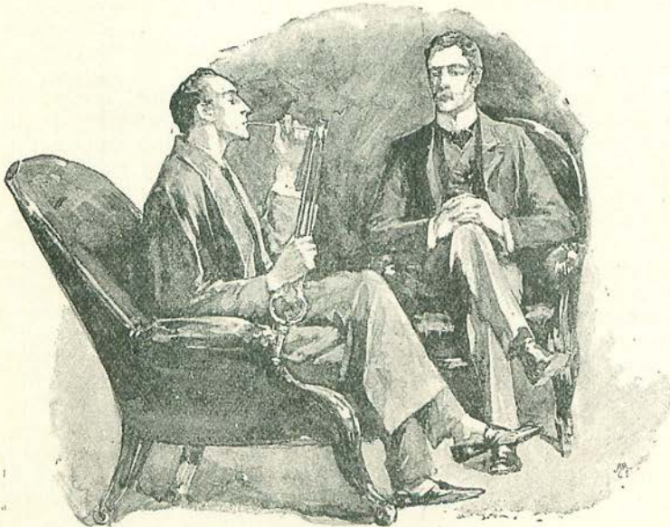
“TAKING UP A GLOWING CINDER WITH THE TONGS.”

It was a cold morning of the early spring, and we sat after breakfast on either side of a cheery fire in the old room at Baker-street. A thick fog rolled down between the lines of dun-coloured houses, and the opposing windows loomed like dark, shapeless blurs through the heavy yellow wreaths. Our gas was lit, and shone on the white cloth, and glimmer of china and metal, for the table had not been cleared yet. Sherlock Holmes had been