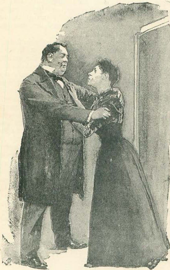
“‘OH! I AM SO FRIGHTENED!’ I PANTED.”

“‘Only that?’ said he, looking at me keenly.