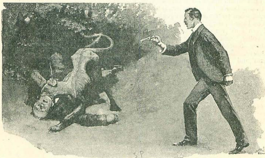
RUNNING UP, I BLEW ITS BRAINS OUT.

"She was never happy at home, Miss Alice wasn't, from the time that her father married again. She was slighted like, and had no say in anything; but it never really became bad for her until after she met Mr. Fowler at a friend's house. As well as I could learn, Miss Alice had rights of her own by will, but she was so quiet and patient, she was, that she never said a word about them, but just left everything in Mr. Rucastle's hands. He knew he was safe