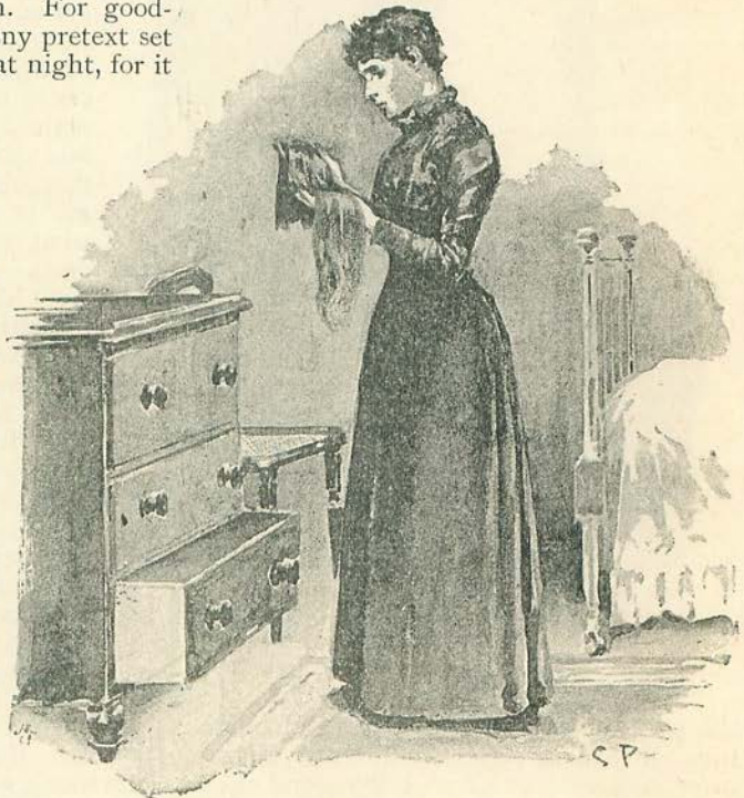
"I TOOK IT UP AND EXAMINED IT.

"I took it up and examined it. It was of the same peculiar tint, and the same thickness. But then the impossibility of the thing obtruded itself upon me. How could my hair have been locked in the drawer?