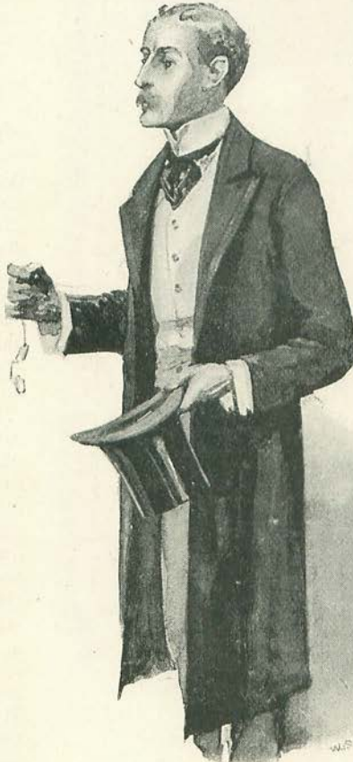
"LORD ROBERT ST. SIMON."

"I brought this with me." He opened a locket, and showed us the full face of a very lovely woman. It was not a photograph, but an ivory miniature, and the artist had brought out the full effect of the lustrous black hair, the large dark eyes, and the exquisite mouth. Holmes gazed long and earnestly at it. Then he closed the