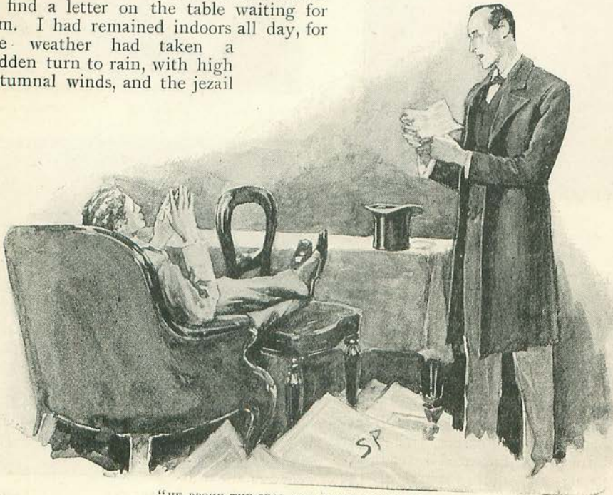
"HE BROKE THE SEAL AND GLANCED OVER THE CONTENTS."

"Yes, my correspondence has certainly the charm of variety," he answered, smiling, "and the humbler are usually the more interesting. This looks like one of those