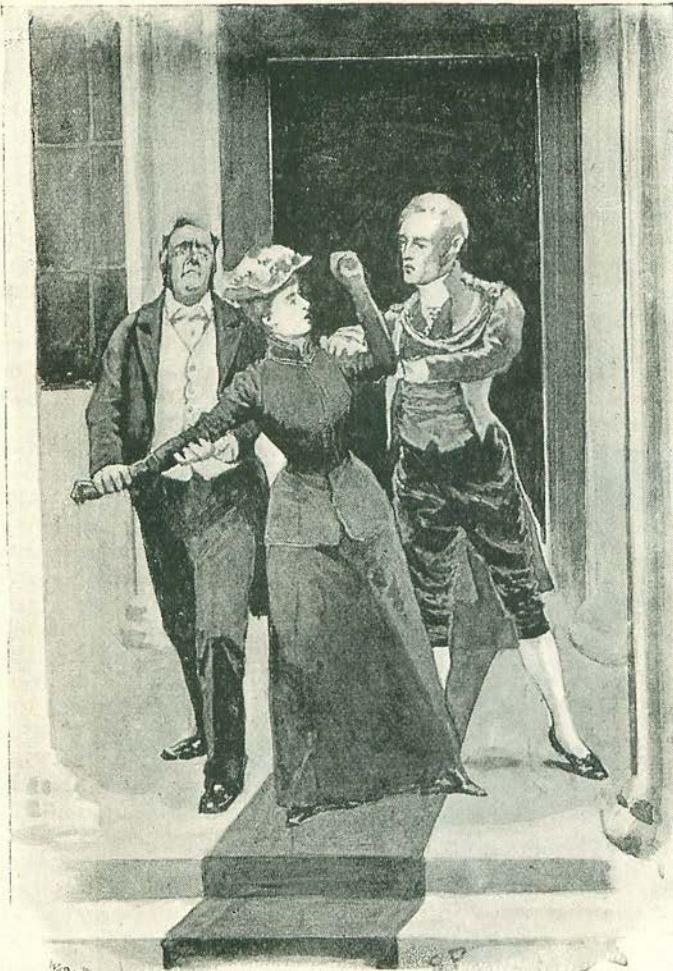
"SHE WAS EJECTED BY THE BUTLER AND THE FOOTMAN."

bably result in a speedy clearing up of this very singular business. Up to a late hour last night, however, nothing had transpired as to the whereabouts of the missing lady. There are rumours of foul play in the matter, and it is said that the police have caused the arrest of the woman who had caused the original disturbance, in the belief that, from jealousy or some other motive, she may have been concerned in the strange disappearance of the bride."