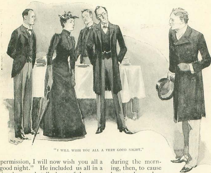
"I WILL WISH YOU ALL A VERY GOOD NIGHT."

obvious to me, the one that the lady had been quite willing to undergo the wedding ceremony, the other that she had repented of it within a few minutes of returning home. Obviously something had occurred