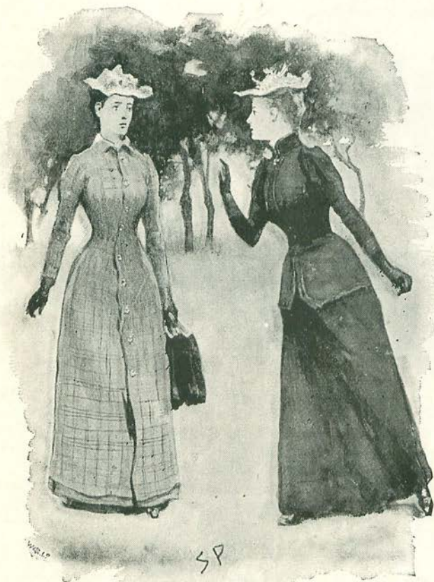
"SOME WOMAN CAME TALKING ABOUT LORD ST. SIMON."

Pa, perhaps, to show him that I was alive. It was awful to me to think of all those lords and ladies sitting round that breakfast table, and waiting for me to come back. So Frank took my wedding clothes and things, and made a bundle of them so that I should not be traced, and dropped them away somewhere where no one should find them. It is likely that we should have gone on to Paris to-morrow, only that this good gentleman, Mr. Holmes, came round to us this evening, though how he found us is more than I can think, and he showed us very clearly and kindly that I was wrong and that Frank was right, and that we should put ourselves in the wrong if we were so secret. Then he offered to give us a chance of talking to Lord St. Simon alone, and so we came right away round to his rooms at once. Now, Robert, you have heard it all, and I am very sorry if I have given you pain, and I hope that you do not think very meanly of me."