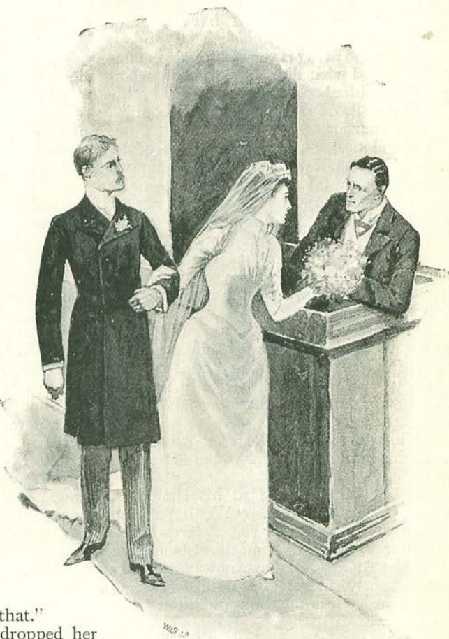
"THE GENTLEMAN IN THE PEW HANDED IT UP TO HER."

"No, no; I call him a gentleman by courtesy, but he was quite a common-looking person. I hardly noticed his appearance. But really I think that we are wandering rather far from the point."