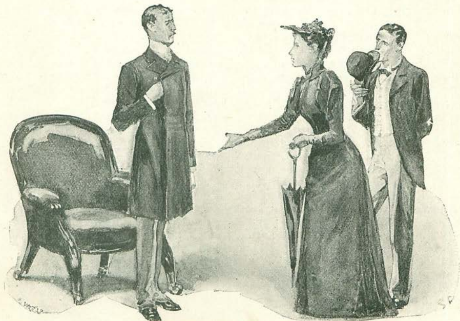
"A PICTURE OF OFFENDED DIGNITY."

At the sight of these new-comers our client had sprung from his seat, and stood very erect, with his eyes cast down and his hand thrust into the breast of his frock coat, a picture of offended dignity. The lady had taken a quick step forward and had held out her hand to him, but he still refused