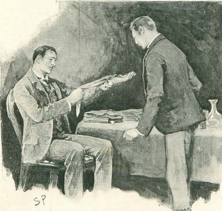
"HE UNWOUND THE HANDKERCHIEF, AND HELD OUT HIS HAND."

"Capital! Between your brandy and your bandage, I feel a new man. I was very weak, but I have had a good deal to go through."