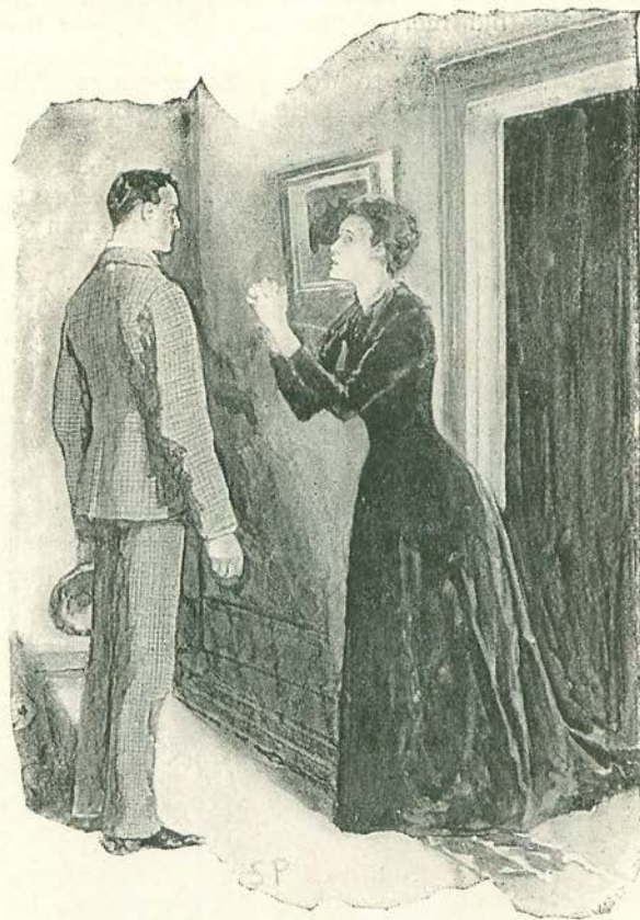
"'GET AWAY FROM HERE BEFORE IT IS TOO LATE.'

"We went upstairs together, the Colonel first with the lamp, the fat manager, and I behind him. It was a labyrinth of an old house, with corridors, passages, narrow winding staircases, and little low doors, the thresholds of which were hollowed out by the generations who had crossed them. There were no carpets, and no signs of any furniture above the ground floor, while the plaster was peeling off the walls, and the damp was breaking through in green, unhealthy blotches. I tried to put on as unconcerned an air as possible, but I had not forgotten the warnings of the lady, even though I disregarded them, and I kept a keen eye upon my two