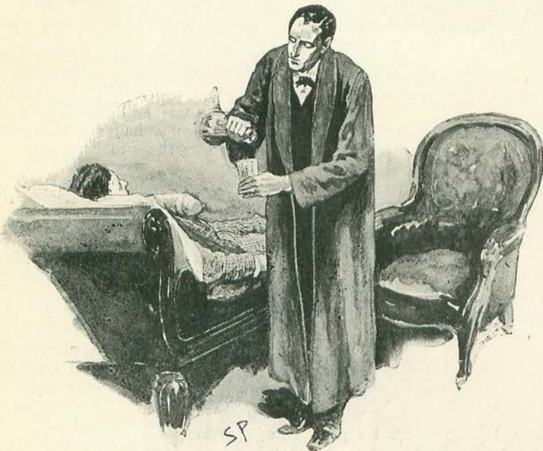
"HE SETTLED OUR NEW ACQUAINTANCE ON THE SOFA.

Sherlock Holmes was, as I expected, lounging about his sitting-room in his dressing-gown, reading the agony column of The Times , and smoking his before-breakfast pipe, which was composed of all the plugs and dottels left from his smokes of the day before, all carefully dried and collected on the corner of the mantel-piece. He received us in his quietly genial fashion, ordered fresh rashers and eggs, and joined us in a hearty meal. When it was concluded he settled our new acquaintance upon the sofa, placed a