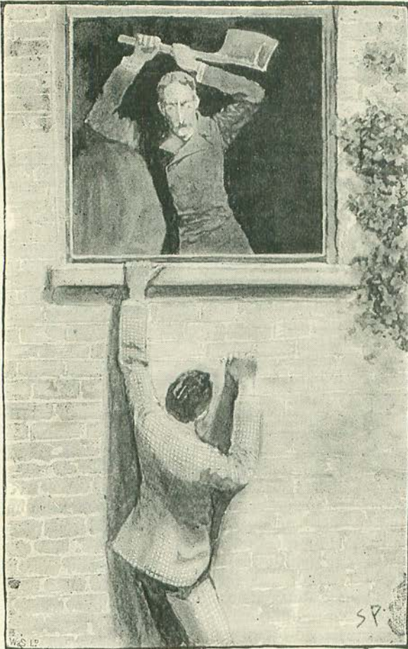
"HE CUT AT ME."

understood that I was far from being out of danger yet. Suddenly, however, as I ran, a deadly dizziness and sickness came over me. I glanced down at my hand, which was throbbing painfully, and then, for the first time, saw that my thumb had been cut off, and that the blood was pouring from my wound. I endeavoured to tie my handkerchief round it, but there came a sudden buzzing in my ears, and next moment I fell in a dead faint among the rose-bushes.