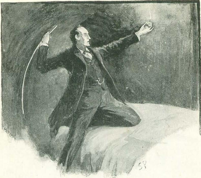
"HOLMES LASHED FURIOUSLY."

smell grew stronger. For half an hour I sat with straining ears. Then suddenly another sound became audible—a very gentle, soothing sound, like that of a small jet of steam escaping continually from a kettle. The instant that we heard it, Holmes sprang from the bed, struck a match, and lashed furiously with his cane at the bell-pull.