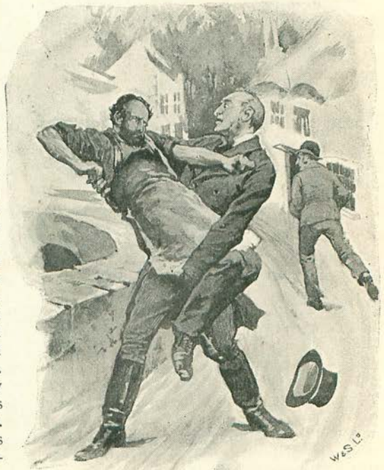
SP "HE HURLED THE BLACKSMITH OVER A PARAPET."

"Last week he hurled the local blacksmith over a parapet into a stream, and it was only by paying over all the money which I could gather together that I was able to avert another public exposure. He had no friends at all save the wandering gipsies, and he would give these vagabonds leave to encamp upon the few acres of