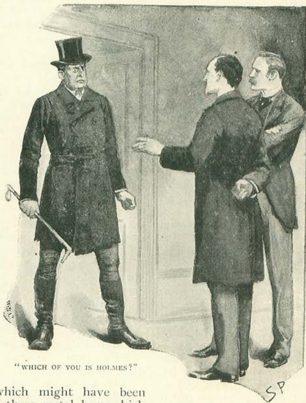
"WHICH OF YOU IS HOLMES?"

"But I have heard that the crocuses promise well," continued my companion imperturbably.