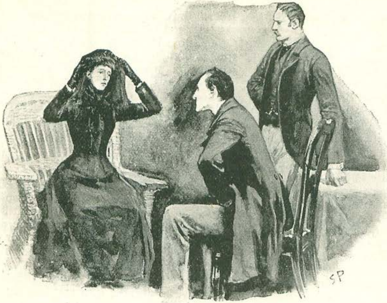
"SHE RAISED HER VEIL."

but her hair was shot with premature grey, and her expression was weary and haggard. Sherlock Holmes ran her over with one of his quick, all-comprehensive glances.