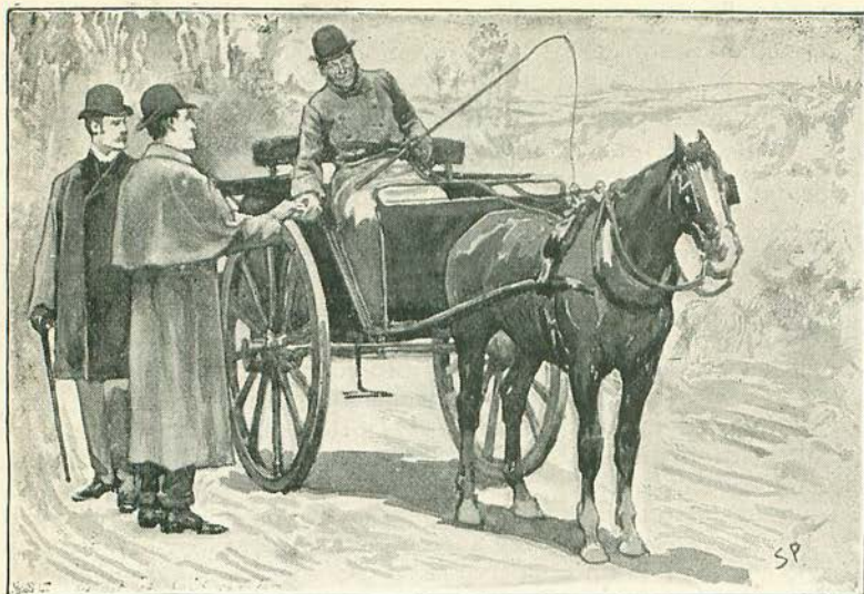
"WE GOT OFF, PAID OUR FARE."

"I thought it as well," said Holmes, as we climbed the stile, "that this fellow should think we had come here as architects, or on some definite business. It may stop his gossip. Good afternoon, Miss Stoner. You see that we have been as good as our word."