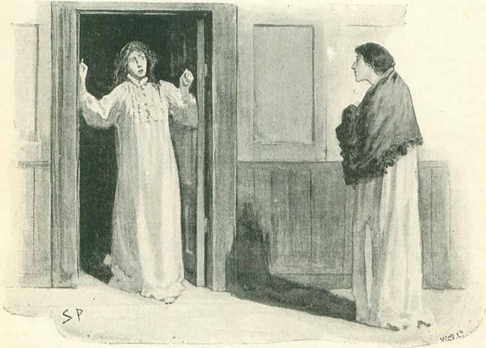
"HER FACE BLANCHED WITH TERROR."

"No, she was in her nightdress. In her right hand was found the charred stump of a match, and in her left a matchbox."