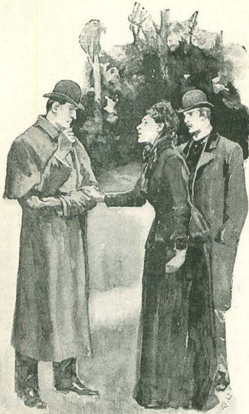
“GOOD-BYE, AND BE BRAVE.”

saw us, our journey would be in vain. Good-bye, and be brave, for if you will do what I have told you, you may rest assured that we shall soon drive away the dangers that threaten you.”