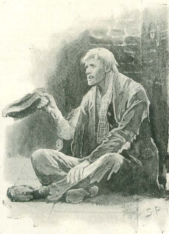
"HE IS A PROFESSIONAL BEGGAR."

for the sinister cripple who lives upon the second floor of the opium den, and who was certainly the last human being whose eyes rested upon Neville St. Clair. His name is Hugh Boone, and his hideous face is one which is familiar to every man who goes much to the City. He is a professional beggar, though in order to avoid the police regulations he pretends to a small trade in wax vestas. Some little distance down Threadneedle-street upon the left hand side there is, as you may have remarked, a small angle in the wall. Here it is that the creature takes his daily seat, cross-legged, with his tiny stock of matches on his lap, and as he is a piteous spectacle a small rain of charity descends into the greasy leather cap which lies upon the pavement beside him. I have watched the fellow more than once, before ever I thought of making his professional acquaintance, and I have been surprised at the harvest which he has reaped in a short time. His appearance, you see, is so remarkable, that no one can pass