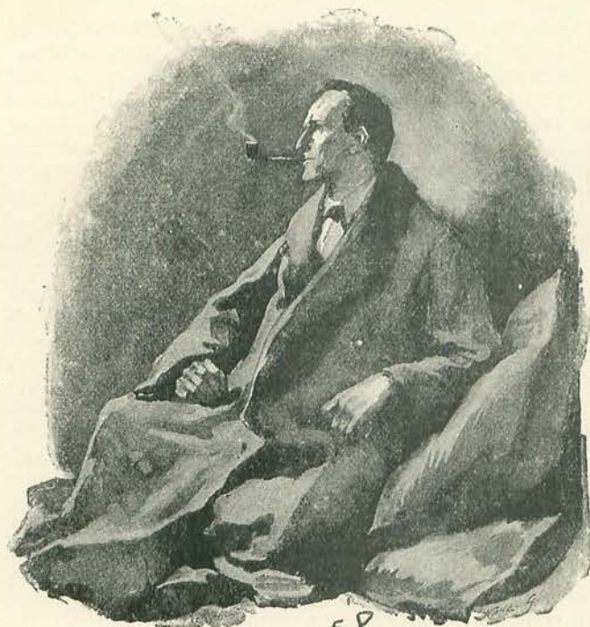
"THE PIPE WAS STILL BETWEEN HIS LIPS."

as possible, and out into the bright morning sunshine. In the road stood our horse and trap, with the half-clad stable boy waiting at the head. We both sprang in, and away we dashed down the London-road. A few country carts were stirring, bearing in vegetables to the metropolis, but the lines of villas on either side were as silent and lifeless as some city in a dream.