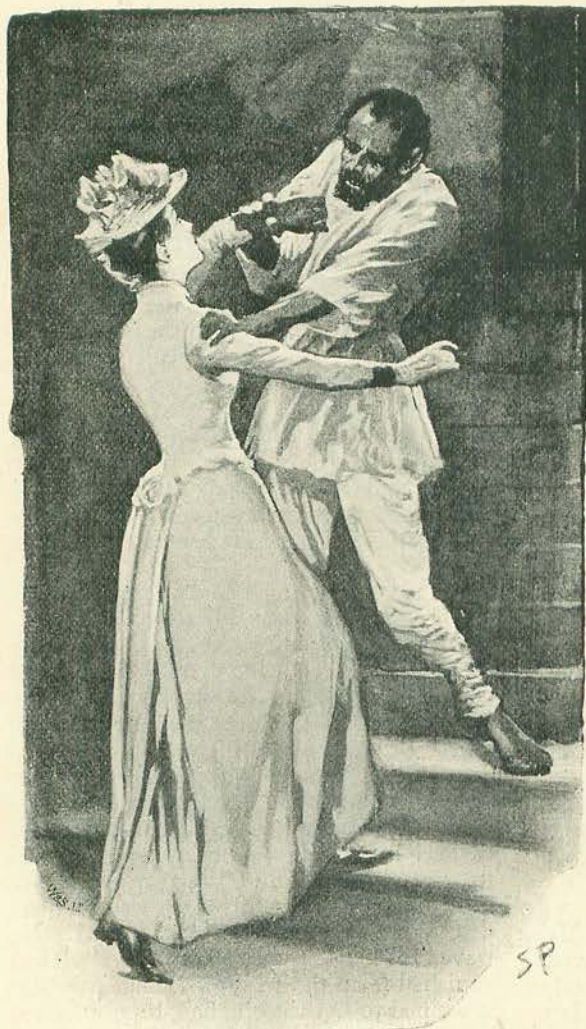
"AT THE FOOT OF THE STAIRS SHE MET THIS LASCAR SCGUNDREL."

ber of constables with an inspector, all on their way to their beat. The inspector and two men accompanied her back, and, in spite of the continued resistance of the proprietor, they made their way to the room in which Mr. St. Clair had last been seen. There was no sign of him there. In fact, in the whole of that floor there was no one to be found, save a crippled wretch of hideous aspect, who, it seems, made his home there. Both he and the Lascar stoutly swore that no one else had been in the front room during the afternoon. So determined was their denial that the inspector was staggered, and had almost come to believe that Mrs. St. Clair had been deluded when, with a cry, she sprang at a small deal box