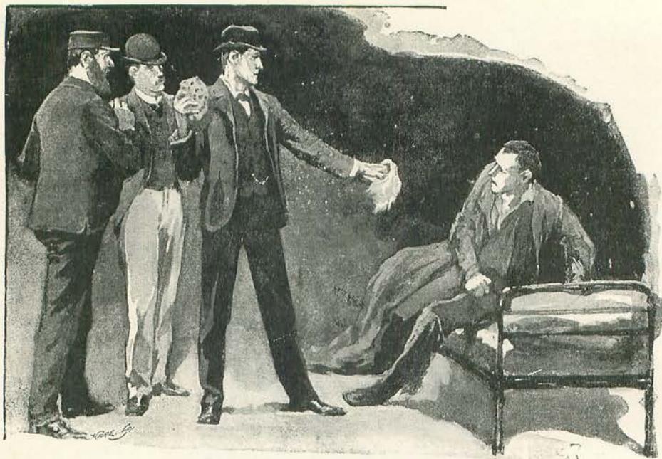
"HE BROKE INTO A SCREAM."

father. My God! What an exposure! What can I do?"