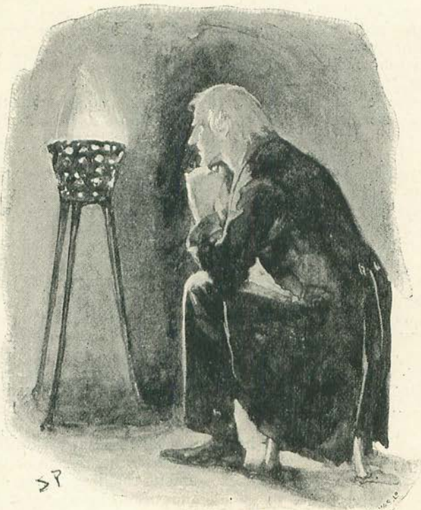
"STARING INTO THE FIRE."

"So I am. But you've got mixed, Watson, for I have only been here a few hours, three pipes, four pipes—I forget how many. But I'll go home with you. I