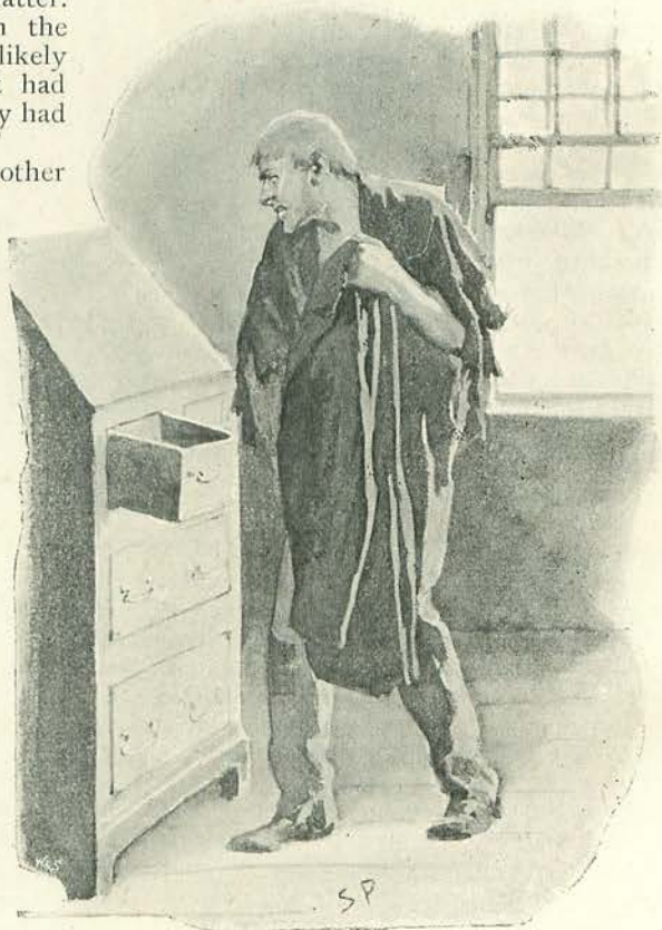
"STUFFS ALL THE COINS INTO THE POCKETS."

"Well, we will take it as a working hypothesis for want of a better. Boone, as I have told you, was arrested and taken to the station, but it could not be shown that there had ever before been anything against him. He had for years been known as a professional beggar, but his life appeared to have been a very quiet and innocent one. There the matter stands at present, and the questions which have to be solved, what Neville St. Clair was doing in the opium den, what happened to him when there, where is he now, and what Hugh Boone had to do with his disappearance, are all as far from a solution as ever. I confess