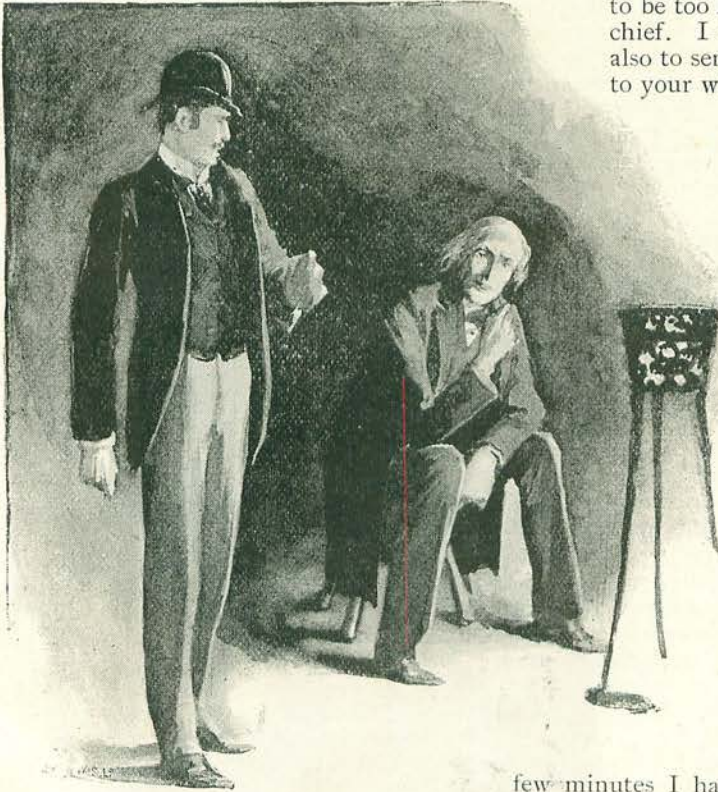
"HOLMES! I WHISPERED."

few minutes I had written my note, paid Whitney's bill, led him out to the cab, and seen him driven through the darkness. In a very short time a decrepit figure had emerged from the opium den, and I was walking down the street with Sherlock Holmes. For two streets he shuffled along with a bent back and an uncertain foot,