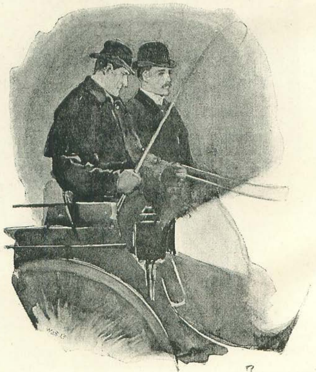
"HE FLICKED THE HORSE WITH HIS WHIP."

He flicked the horse with his whip, and we dashed away through the endless succession of sombre and deserted streets, which widened gradually, until we were flying across a broad balustraded bridge, with the murky river flowing sluggishly beneath us. Beyond lay another dull wilderness of bricks and mortar, its silence broken only by the heavy, regular footfall of the policeman, or the songs and shouts of some belated party of revellers. A dull wrack was drifting slowly across the sky,