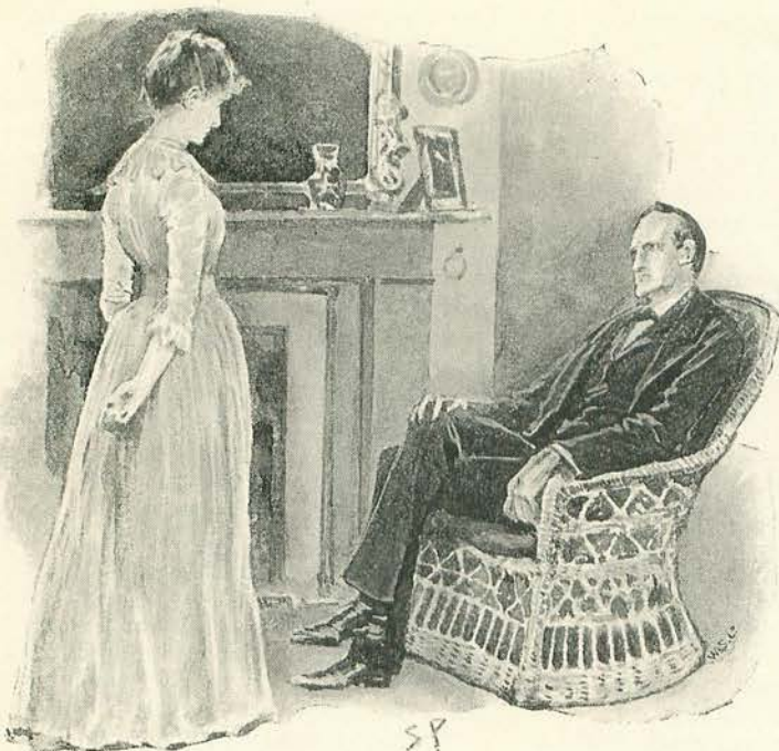
"'FRANKLY, NOW,' SHE REPEATED."

intently. I had left my chair, and was gazing at it over his shoulder. The envelope was a very coarse one, and was stamped with the Gravesend post-mark, and with the date of that very day, or rather of the day before, for it was considerably after midnight.