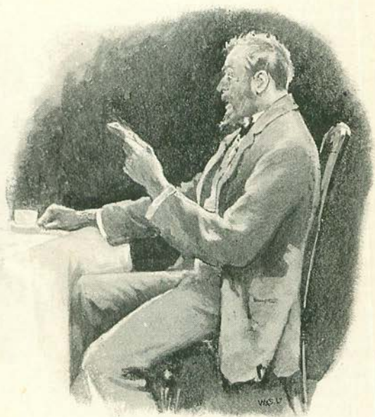
"WHAT ON EARTH DOES THIS MEAN?"

second day of his absence I received a telegram from the Major, imploring me to come at once. My father had fallen over one of the deep chalk-pits which abound in the neighbourhood, and was lying senseless, with a shattered skull. I hurried to him, but he passed away without having ever recovered his consciousness. He had, as it appears, been returning from Fareham in the twilight, and as the country was unknown to him, and the chalk-pit unfenced, the jury had no hesitation in bringing in a verdict of 'Death from accidental causes.' Carefully as I examined every fact connected with his death, I was unable to find