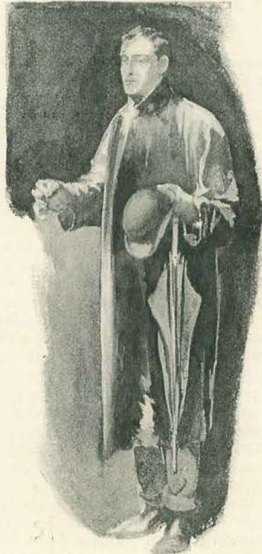
"HE LOOKED ABOUT HIM ANXIOUSLY."

"My uncle Elias emigrated to America when he was a young man, and became a planter in Florida, where he was reported to have done very well. At the time of the war he fought in Jackson's army, and afterwards under Hood, where he rose to be a colonel. When Lee laid down his arms my uncle returned to his plantation, where he remained for three or four years. About 1869 or 1870 he came back to Europe, and took a small estate in Sussex, near Horsham. He had made a very considerable fortune in the States, and his reason for leaving them was his aversion to the negroes, and his dislike of the Republican policy in extending the franchise to them. He was a singular man, fierce and quick-tem-