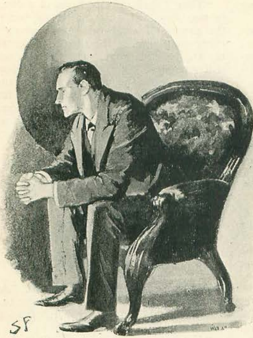
"HIS EYES BENT UPON THE GLOW OF THE FIRE."

free education and encyclopædias, is a somewhat rare accomplishment. It is not so impossible, however, that a man should possess all knowledge which is likely to be useful to him in his work, and this I have endeavoured in my case to do. If I remember rightly, you on one occasion, in the early days of our friendship, defined my limits in a very precise fashion."