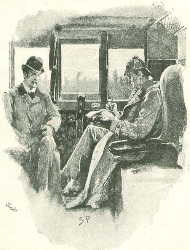
"WE HAD THE CARRIAGE TO OURSELVES."

"The London press has not had very full accounts. I have just been looking through all the recent papers in order to master the particulars. It seems, from what I gather, to be one of those simple cases which are so extremely difficult."