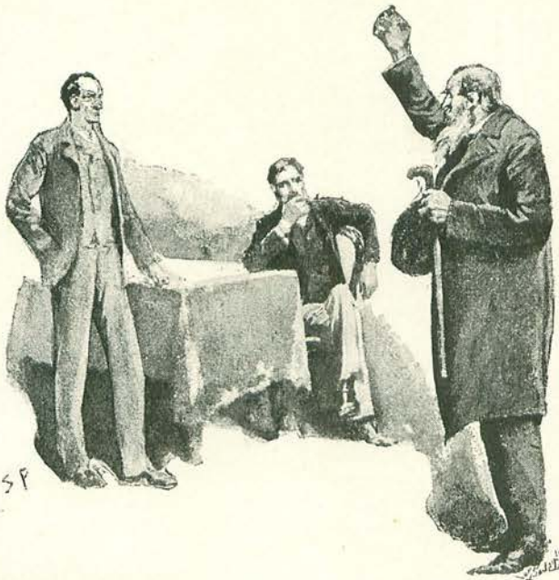
"FAREWELL, THEN," SAID THE OLD MAN.

"Farewell! then," said the old man, solemnly. "Your own death-beds, when they come, will be the easier for the thought of the peace which