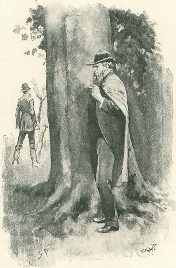
"HE HAD STOOD BEHIND THAT TREE."

Sherlock Holmes took a folded paper from his pocket and flattened it out on the table. "This is a map of the Colony of Victoria," he said. "I wired to Bristol for it last night." He put