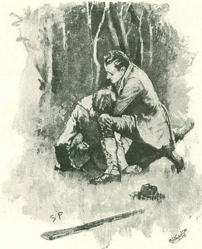
"I HELD HIM IN MY ARMS."

"Witness : He mumbled a few words, but I could only catch some allusion to a rat.