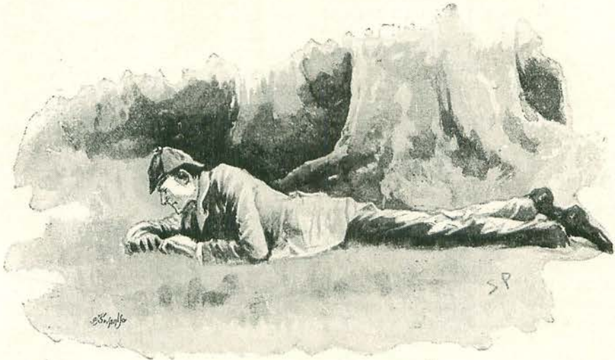
"FOR A LONG TIME HE REMAINED THERE."

and this also he carefully examined and retained. Then he followed a pathway through the wood until he came to the high road, where all traces were lost.