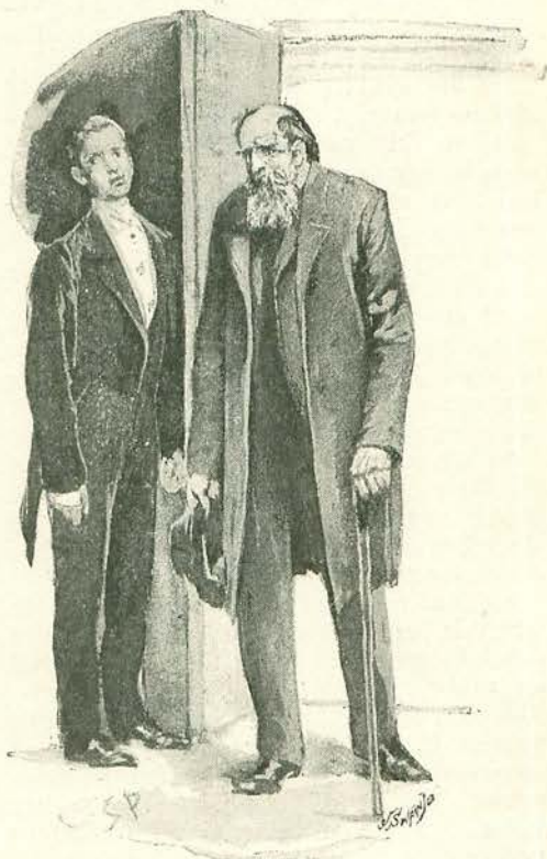
"MR. JOHN TURNER," SAID THE WAITER.

The man who entered was a strange and impressive figure. His slow, limping step and bowed shoulders gave the appearance of decrepitude, and yet his hard, deep-lined, craggy features, and his enormous limbs showed that he was possessed of unusual