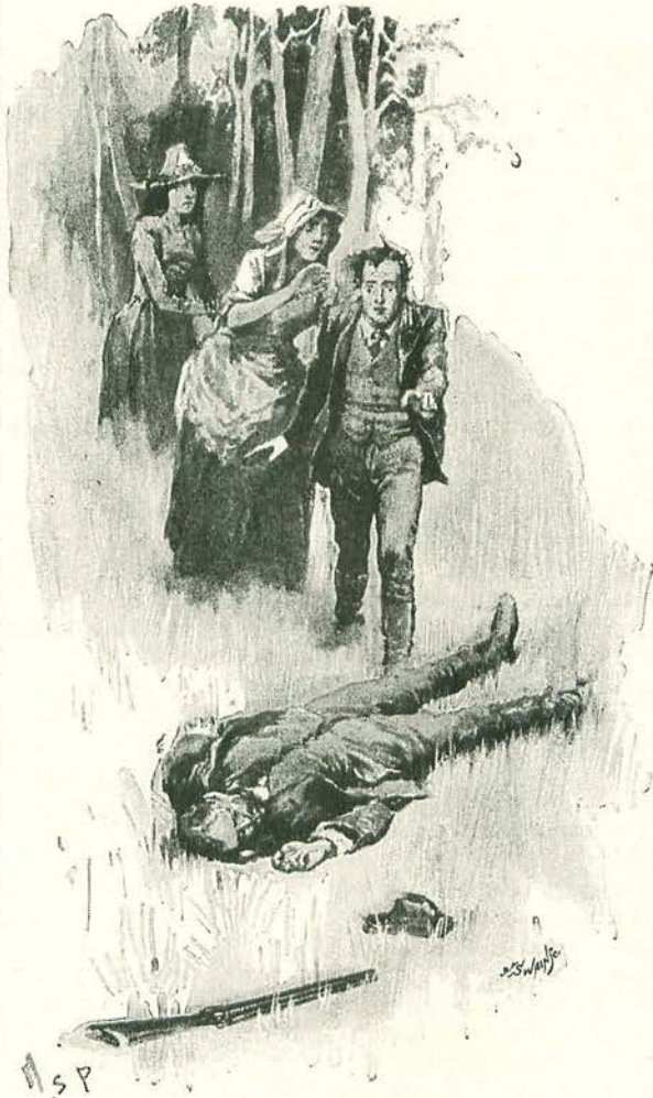
"THEY FOUND THE BODY."

"There is nothing more deceptive than an obvious fact," he answered, laughing.