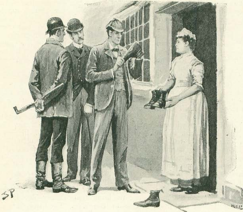
"THE MAID SHOWED US THE BOOTS."

dead, and once he made quite a little détour into the meadow. Lestrade and I walked behind him, the detective indifferent and contemptuous, while I watched my friend with the interest which sprang from the conviction that every one of his actions was directed towards a definite end.