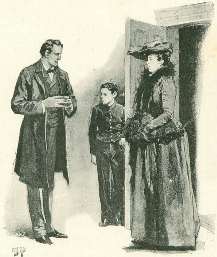
"SHERLOCK HOLMES WELCOMED HER."

"Never mind," said Holmes, laughing, "It is my business to know things. Perhaps I have trained myself to see what others overlook. If not, why should you come to consult me?"