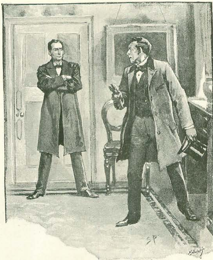
"GLANCING ABOUT HIM LIKE A RAT IN A TRAP."

his pockets, began talking, rather to himself, as it seemed, than to us.