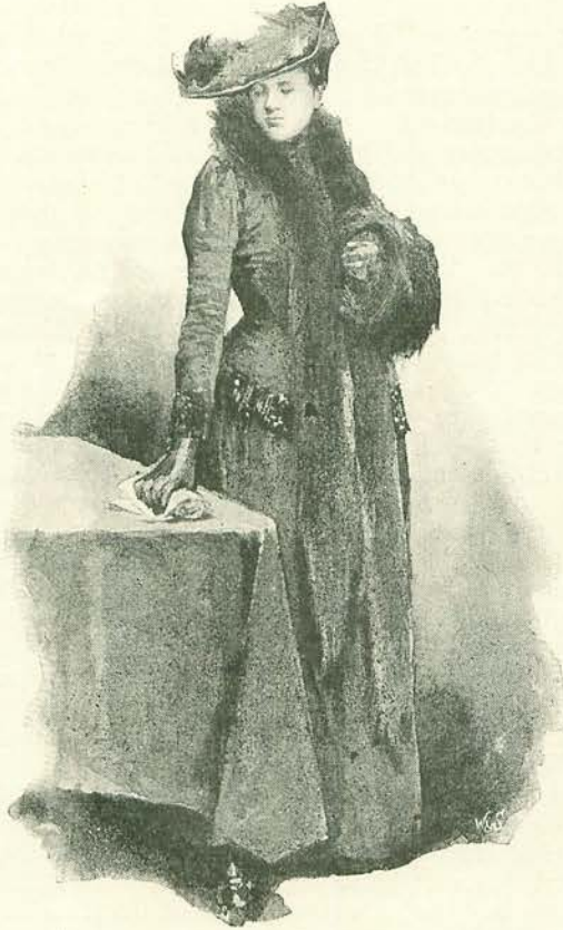
"SHE LAID A LITTLE BUNDLE UPON THE TABLE."

"Quite an interesting study, that maiden,"