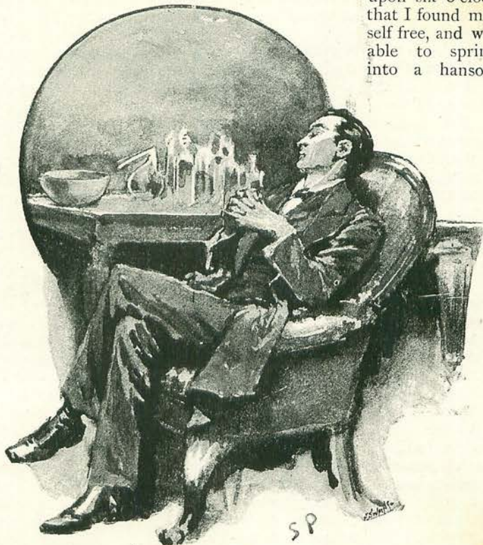
“I FOUND SHERLOCK HOLMES HALF ASLEEP.”

A professional case of great gravity was engaging my own attention at the time, and the whole of next day I was busy at the bedside of the sufferer. It was not until close upon six o’clock that I found myself free, and was able to spring into a hansom