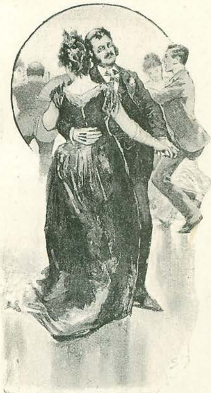
"AT THE GASFITTERS' BALL."

called next day to ask if we had got home all safe, and after that we met him—that is to say, Mr. Holmes, I met him twice for walks, but after that father came back again, and Mr. Hosmer Angel could not come to the house any more."