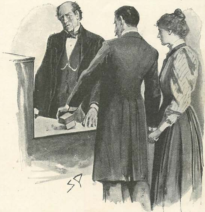
"HE TILTED OUT THE CONTENTS."

"That I got them. They are in this box.'