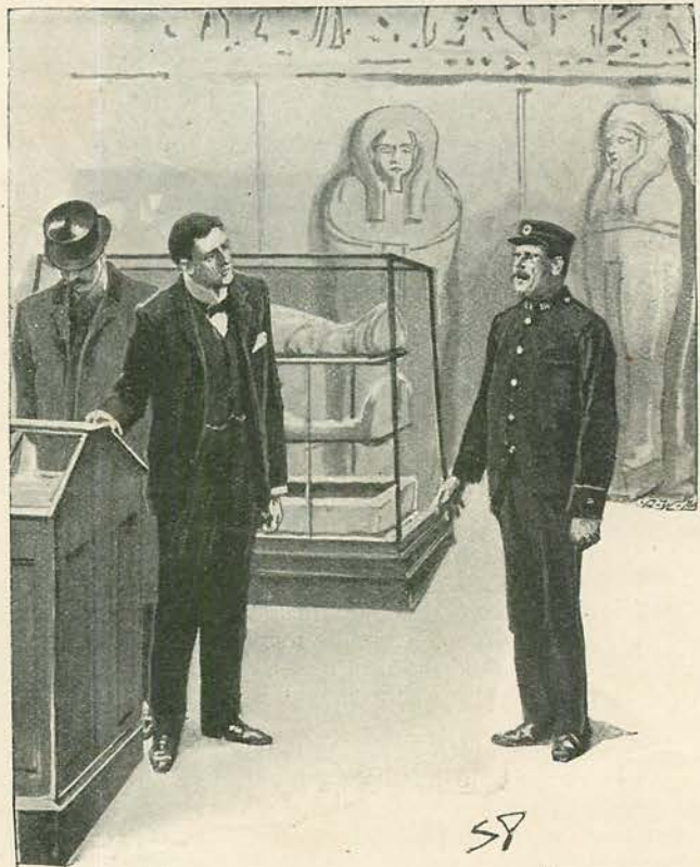
"I NEVER SAW A SOUL, OR HEARD A SOUND."