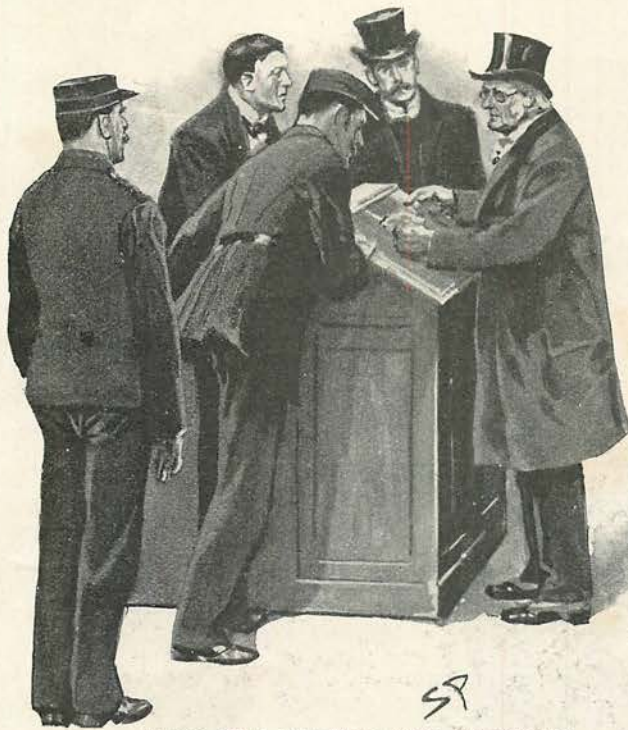
"I WILL SWEAR THAT THOSE STONES ARE GENUINE."

His investigation, which lasted all the morning, was careful and intelligent, but it led in the end to nothing. He pointed out to us that there were two possible entrances to the museum which we had not considered. The one was from the cellars by a trap-door