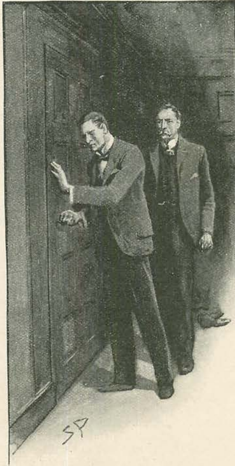
"THIS HE OPENED SOFTLY WITH HIS KEY."