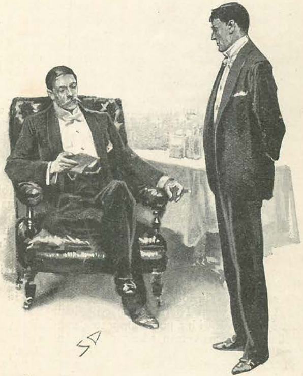
"THIS WARNING IS MEANT IN A FRIENDLY SPIRIT."

put up the great iron shutters, which are absolutely burglar-proof. The watchman is a capable fellow. He sits in the lodge, but he walks round every three hours. We keep one electric light burning in each room all night."