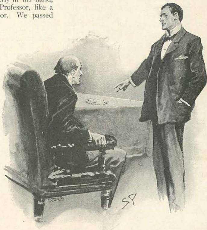
"MORTIMER POINTED REPROACHFULLY AT THE PLATE."

"I could devise no other means. I thought and thought, but there was no alter-