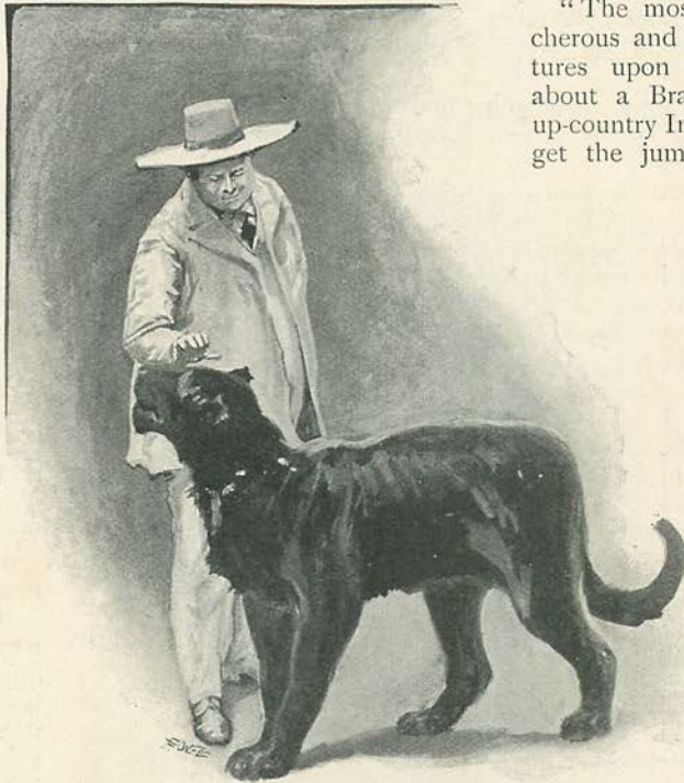
"HE PATTED AND FONDLED IT."