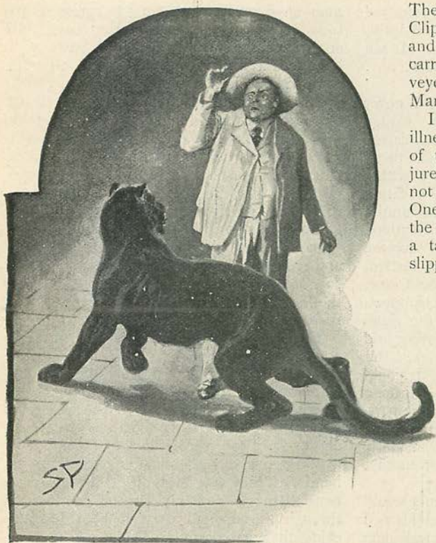
"DOWN, YOU STUPID BEAST!" HE ROARED.

And then I heard him fall, and rise, and fall again, with a sound like the ripping of sacking. His screams grew fainter until they were lost in the worrying snarl. And then, after I thought that he was dead, I saw, as in a nightmare, a blinded, tattered, blood-soaked figure running wildly round the room—and that was the last glimpse which I had of him before I fainted once again.