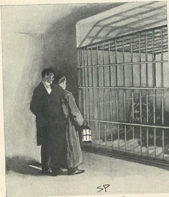
"WE SAW IT, A HUGE BLACK MASS."

a madman. I was a madman with rage and horror. For a minute or more I held the thing motionless. I knew that he was straining with all his force upon the handle, and that the leverage was sure to overcome me. I gave inch by inch, my feet sliding along the stones, and all the time I begged and prayed this inhuman monster to save me from