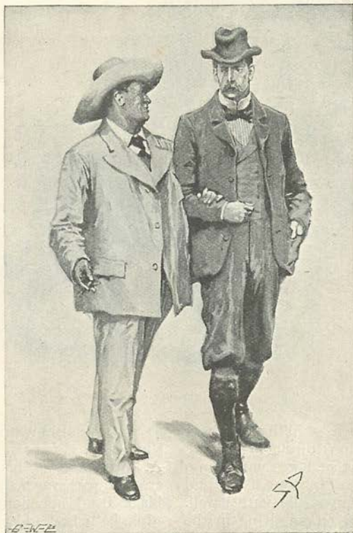
"WE WALKED UP AND DOWN,"

"You must not take it seriously," said he. "It would grieve me inexpressibly if you curtailed your visit by one hour. The fact is—there is no reason why there should be any concealment between relatives—that my poor, dear wife is incredibly jealous. She hates that anyone—male or female—should for an instant come between us. Her ideal is a desert island and an eternal tête-à-tête . That gives you the clue to her actions,