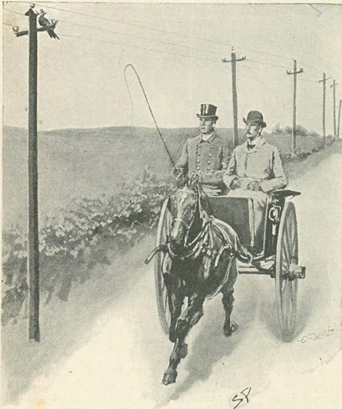
"A VERY BEAUTIFUL BIRD."

However, my debts were too pressing and my designs upon my wealthy relative were too vital for me to allow them to be upset by the ill-temper of his wife, so I disregarded her coldness and reciprocated the extreme cordiality of his welcome. No pains had been spared by him to make me comfortable,