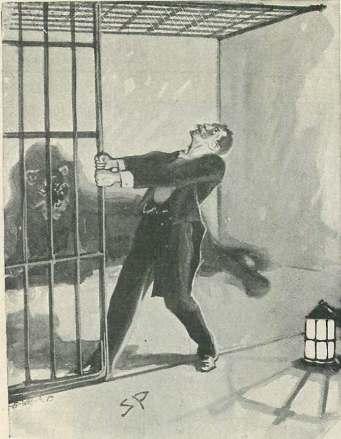
"I WAS DRAGGED ACROSS THE WHOLE FRONT OF THE CAGE."

the lantern when I seized the bars, but it still burned upon the floor, and I made a movement to grasp it, with some idea that its light might protect me. But the instant I moved, the beast gave a deep and menacing growl. I stopped and stood still, quivering with fear in every limb. The cat (if one may call so fearful a creature by so homely a name) was not more than ten feet from me. The eyes glimmered like two discs of phosphorus in