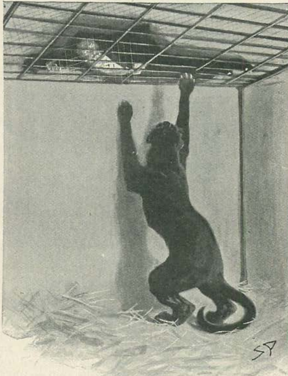
"IT DREW ITS CLAWS ALONG THE WIRE MESHES BENEATH ME."

It was a miserable hour to meet such a death—so cold, so comfortless, shivering in my light dress clothes upon this gridiron of torment upon which I was stretched. I tried to brace myself to it, to raise my soul above it, and at the same time, with the lucidity which comes to a perfectly desperate man, I cast round for some possible means of escape. One thing was clear to me. If that front of the cage was only back in its position once more, I could find a sure refuge behind it. Could I possibly pull it back? I hardly dared to move for fear of bringing the creature upon me. Slowly, very slowly, I put my hand forward until it grasped the edge of the front, the final bar which protruded through the wall. To my surprise it came quite easily to my jerk. Of course