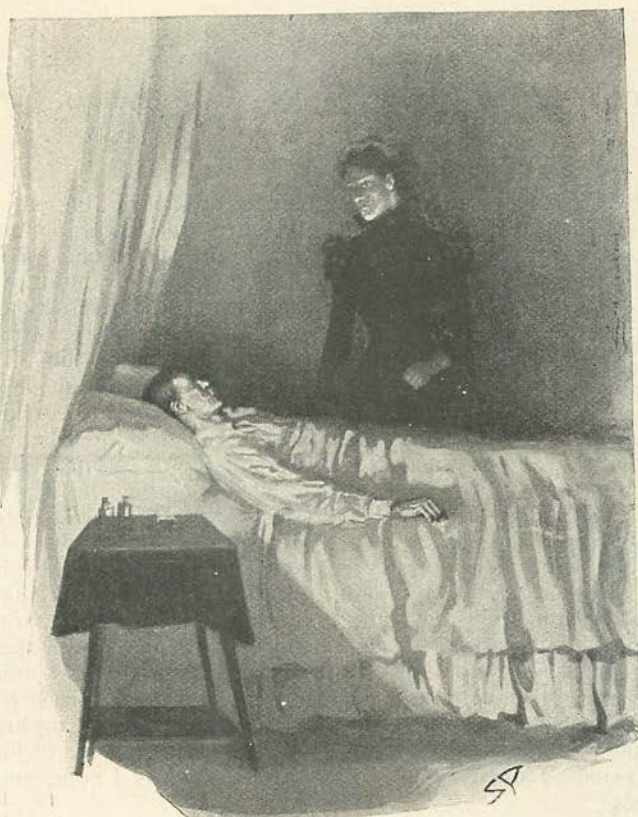
“ARE YOU CONSCIOUS?” SHE ASKED.”

was Summers, my lawyer, who first took advantage of it.