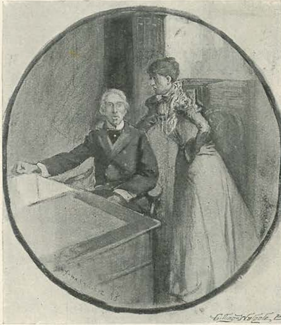
"THEY WERE BROTHER AND SISTER."

"As far as Pangbourne. Meet me at the bookstall at 3.30. I shall have the tickets. Good-bye, Dr. Hamilton! And, by the way, there are two things which I should be very glad if you would bring with you, in case you have them. One is your case for collecting beetles, and the other is a stick, and the thicker and heavier the better."