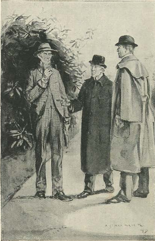
"LET ME PRESENT YOU TO SIR THOMAS ROSSITER."

I have said that Sir Thomas Rossiter wore a large hat drawn down over his brows. As he entered the hall he uncovered himself, and I was at once aware of a singular characteristic which the hat had concealed. His forehead, which was naturally high, and higher still on