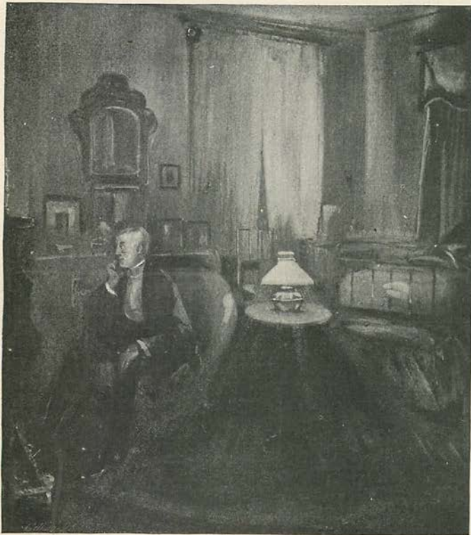
"A MELANCHOLY VIGIL."

"Quick! Quick!" said Lord Linchmere's voice in my ear.