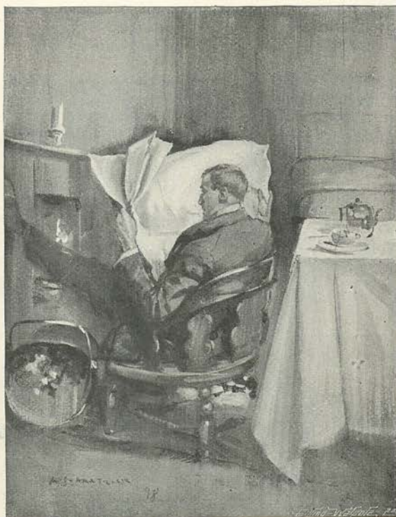
"MY EYES WERE CAUGHT BY AN ADVERTISEMENT."

zoology, the study of insects was the most attractive to me, and of all insects the beetles were the species with which I was most familiar. Butterfly collectors are numerous, but the beetles are far more varied, and more accessible in these islands than are the butterflies. It was this fact which had attracted my attention to them, and I had myself made a collection which numbered