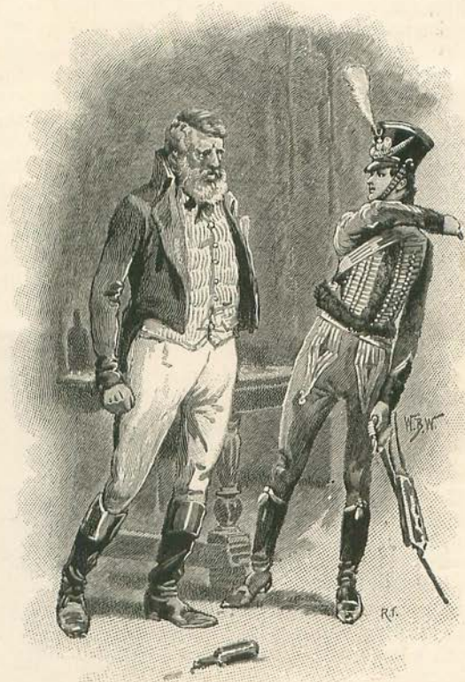
"DUROC'S PATIENCE COULD STAND NO MORE."

"My sabre!" cried the other; "I will not