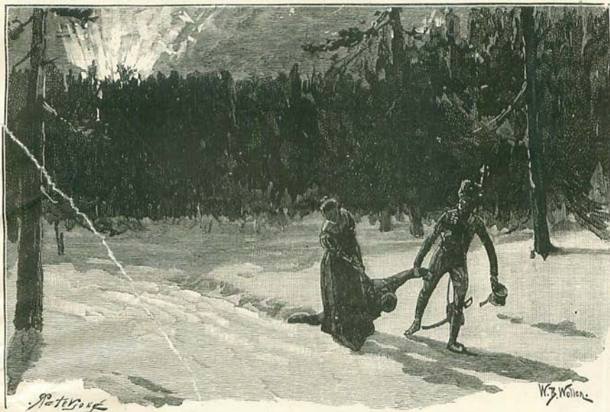
"I SAW A GREAT SPOUT OF FIRE SHOOT UP."

told me how a piece of timber had struck me on the head and had laid me almost dead upon the ground. From him, too, I learned how the Polish girl had run to Arensdorf, how she had roused our hussars, and how she had only just brought them back in time to save us from the spears of the Cossacks who had been summoned from their bivouac by that same black-bearded secretary whom we had seen galloping so swiftly over the snow. As to the brave lady who had twice saved our lives, I could not learn very much about her at that