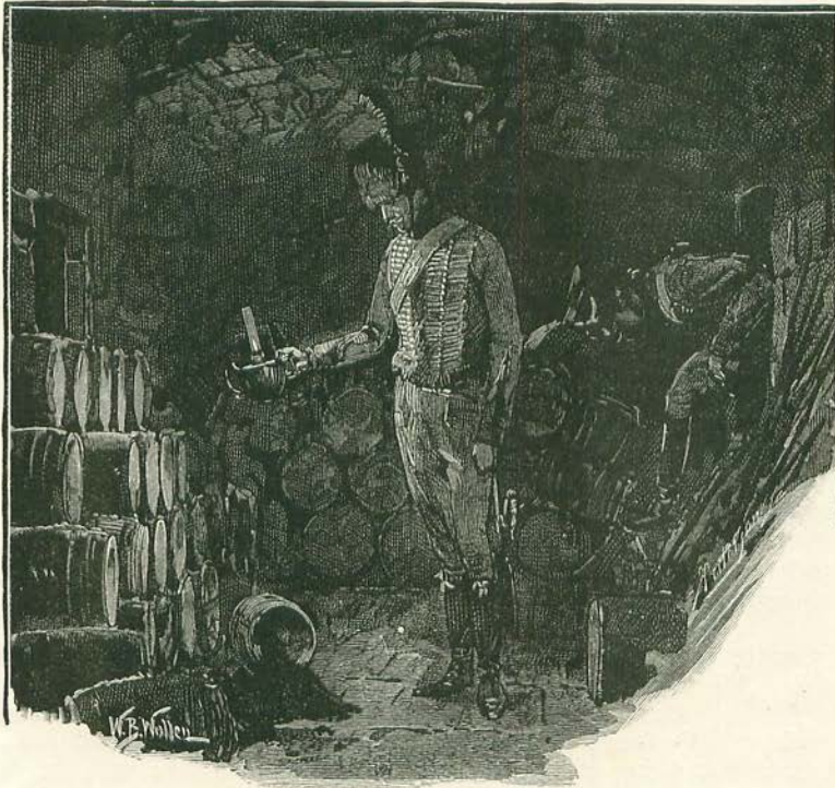
"WE WERE IN THE POWDER-MAGAZINE OF THE CASTLE."

We were in the powder-magazine of the castle—a rough, walled cellar, with barrels all round it, and one with the top staved in in the centre. The powder from it lay in a black heap upon the floor. Beyond there was another door, but it was locked.