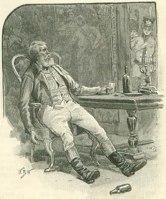
"FACING US THERE SAT A HUGE MAN."

It was a small room, scantily furnished, with the same marks of neglect and decay which met us at every turn. The walls were hung with discoloured tapestry, which had come loose at one corner, so as to expose the rough stonework behind. A second door, hung with a curtain, faced us upon the other side. Between lay a square table, strewn with dirty dishes and the sordid remains of a meal. Several bottles were scattered over it. At the head of it, and facing us, there sat a huge man, with a lion-like head and a great shock of orange-coloured hair. His beard was of the same