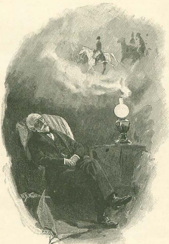
"WHEN I DOZE IN MY ARM-CHAIR, I SEE THOSE GREAT WARRIORS."

cuirassiers, Poniatowsky's lancers, the white-mantled dragoons, the nodding bearskins of the horse grenadiers. And then there comes the thick, low rattle of the drums, and through wreaths of dust and smoke I see the line of high bonnets, the row of brown faces, the swing and toss of the long, red plumes amid the sloping lines of steel.