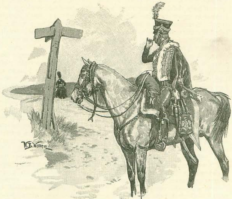
"I SAW HIS BIG FUR CAP VANISH."

When I heard that Blucher had been there for two days, I was much surprised that the Emperor should not have known that the country through which he had ordered me to carry my precious letter was already occupied by the enemy. Still, I thought of the tone of his voice when he said to Charpentier that a soldier must not choose, but must obey. I should follow the route he had laid down for me as long as Violette could move a hoof or I a finger upon her bridle. All the