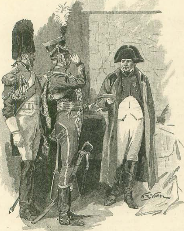
"HE HANDED OUR LETTERS TO US."

threw out my chest, smiling and nodding to let him know that I saw what he would be after. He smiled also, and rested his hand for a moment upon the cape of my dolman. I would have given half my arrears of pay if my mother could have seen me at that instant.