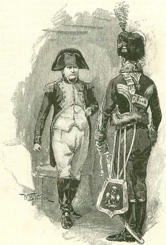
"WHAT ARE YOU DOING HERE?" HE SHOUTED.

I need not say that I rode back by a safe route, for I had seen quite enough of Uhlans and Cossacks. I passed through Meaux and Château Thierry, and so in the evening I arrived at Rheims, where Napoleon was still lying. The bodies of our fellows and of St. Prest's Russians had all been buried, and I