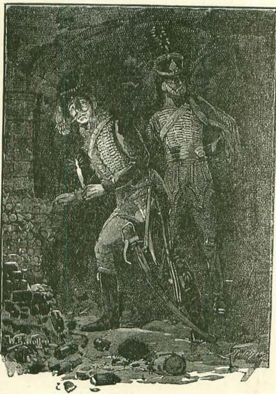
"THERE CAME A ROAR OF MUSKETRY FROM ABOVE US."

Bouvet is a brave man: I will say that for