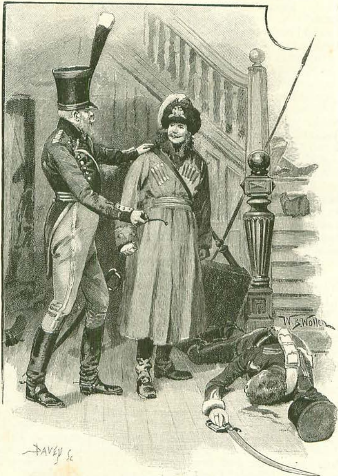
I LAUGHED HEARTILY.

I thought of how old Bouvet had behaved under the same conditions, and the tears sprang to my eyes as I contemplated the glory of France. Then I had to consider what I should do next. It was clear that this Russian Count, being in the back cellar while we were in the front one, had not heard the sounds which would have told him that the house was once again in the hands of his own allies. If he should once understand this the tables would be turned, and I should be his prisoner instead of he being