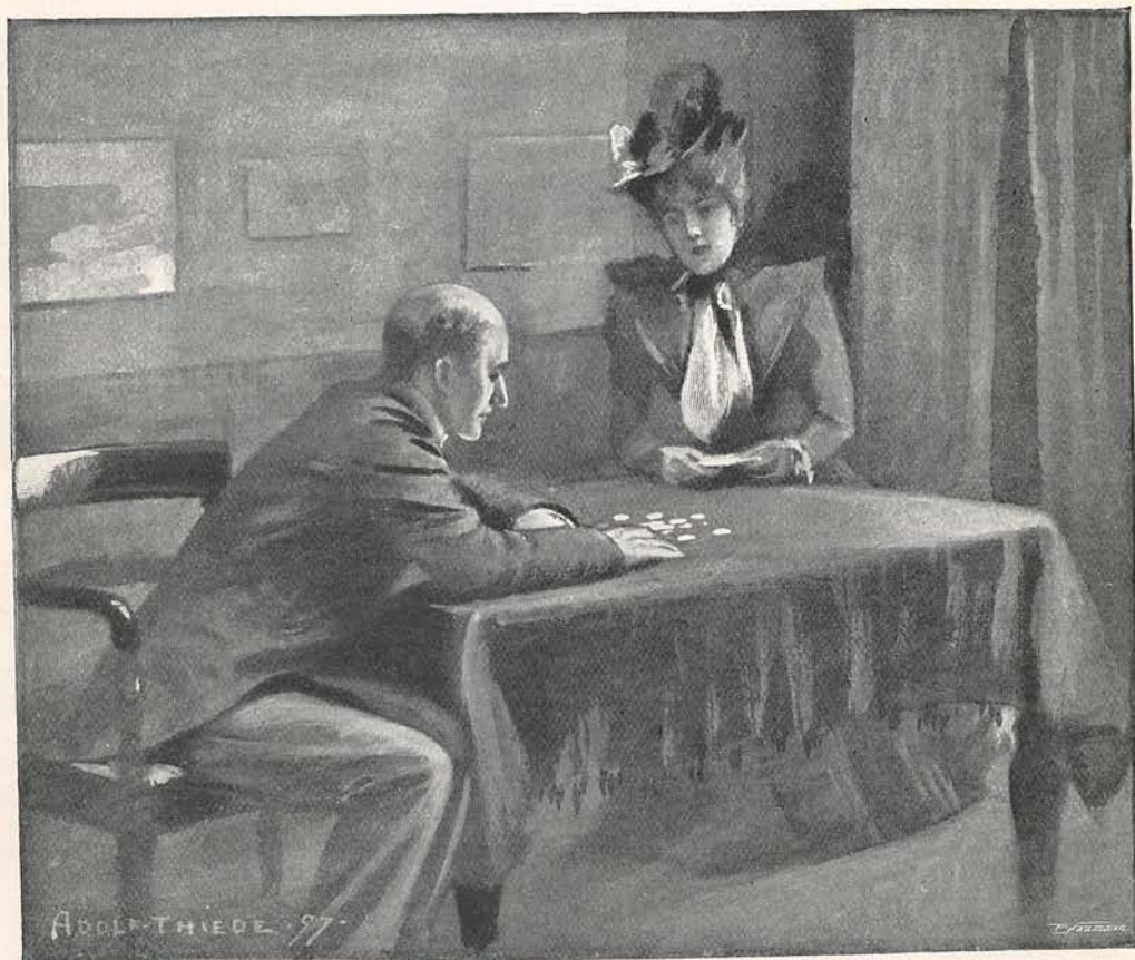
"Hazel, with trembling fingers, counted them out two by two."

Mr. Stoneham, with a craft worthy of all