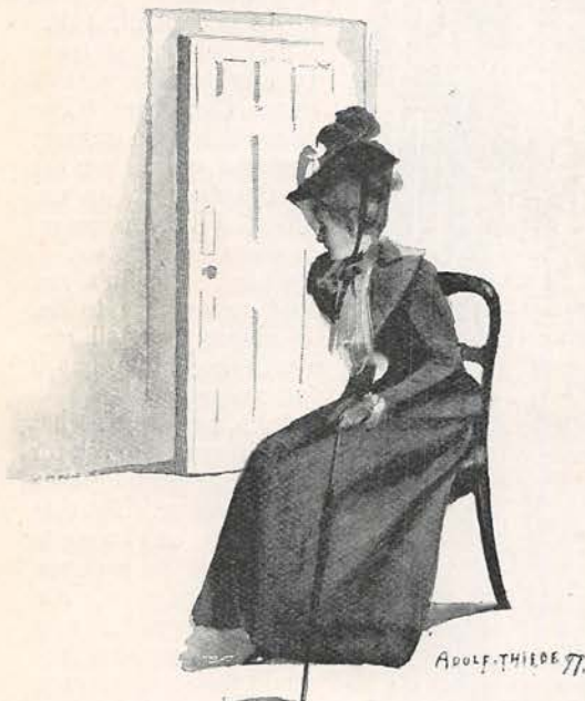
"Miss Baxter sat down, ready to intercept the flying editor."

worth, mum, to put ye in that room beyont the one where the men are waitin'; but, to tell you the truth, miss," said the Irishman, lowering his voice, as if he were divulging office secrets, "Mr. Hardwick, who is a difficult man to deal with, sometimes comes through the shmall room, and out into the passage, whin he doesn't want to see anyone at all, at all, and goes out into the strate, leavin' everybody waitin' for him. Now I'll put ye into this room, and if the editor tries to slip out, then ye can speak with him; but if he asks ye how ye got there, for the sake of hiven don't tell him that I sint ye, because that's not my duty at all, at all."