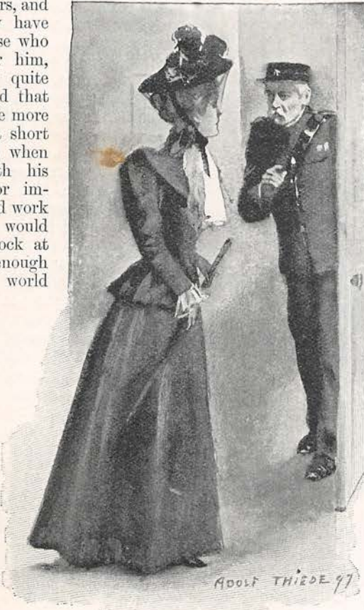
"What did you wish, miss?"

"Indade, miss, an' I'm not so sure there is a way, unless you met him in the strate, which is unlikely. As I've told ye, there's twelve men now waitin' for him in the big room. Beyond that room there's another one, an' beyond that again is Mr. Hardwick's office. Now, it's as much as my place is