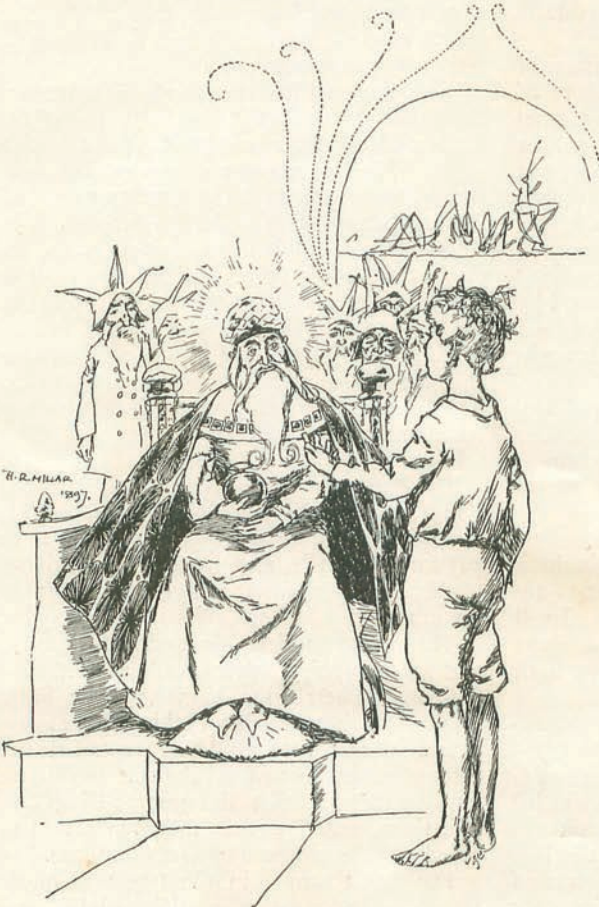
"IT IS TIME I RETURNED TO MY MOTHER."

Want was now at an end for ever, for the wreath was a hundred times more valuable than the tiny branch. Great excitement prevailed in the village when the widow's good fortune was made known, and all the villagers ran into the forest to search for the wonderful hole. But their searching was vain—none ever found the entrance to the mountain. From henceforth the widow and her children lived very happily; they remained pious and industrious in spite of their wealth, did good to the poor, and were contented to the end of their lives.