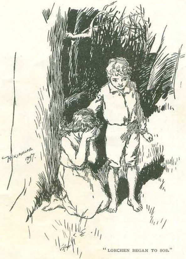
"LORCHEN BEGAN TO SOB."

He turned quickly into the forest. Lorchen waited a moment, and cried, "Fried, Fried!"