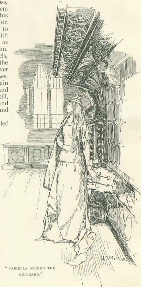
"FABIELLA OPENED THE CUPBOARD."