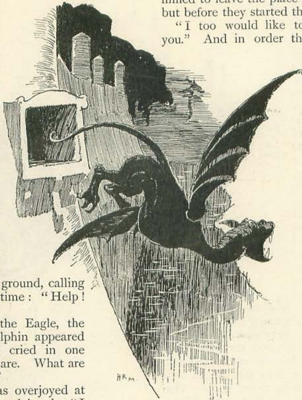
"THE DRAGON FLYING OUT OF THE WINDOW."

Then Tittone spoke with a sigh : "Ah ! why can my poor father and mother not