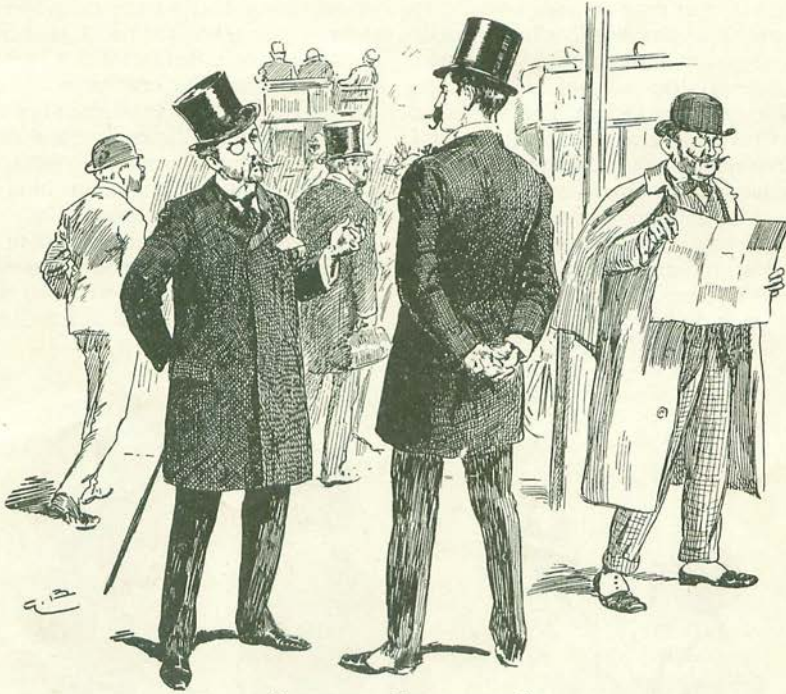
"'COMMISSION?' HE INQUIRED."

A secretary, after all, can do a great deal. When it came to the scratch, I had but little difficulty in persuading Sir Charles, with Amelia's aid, backed up on either side by Isabel and Césarine, to accede to the Count's more reasonable proposal. The Southampton Row people had possession of