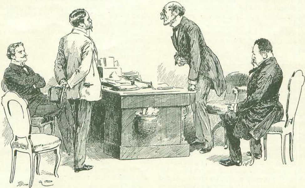
"AS TO PRICE, THE LAWYERS WERE OBDUATE."

Things dragged on in this way, inconclusively, for a week or two. We bid down; the lawyers stuck to it. Sir Charles grew half sick of the whole silly business. For my own part, I felt sure if the high, well-born Count didn't quicken his pace, my respected relative would shortly have had enough of the Tyrol altogether, and be proof against the most lovely of crag-crowning castles. But the Count didn't see it. He came to call on us at our hotel—a rare honour for a stranger with these haughty and exclusive Tyrolese nobles—and even entered unannounced in