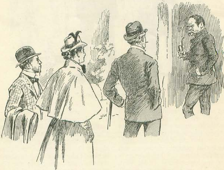
"WE WERE MET AT THE DOOR BY THE SURLY STEWARD."

Bit by bit it all came out. He had ridden behind us the first day we viewed the place, and, giving himself out to the servants as one of our party, had joined us in the reception-room. We asked the real Count why he had spoken to the intruder. The Count explained in French that the man with the moustache had introduced my brother-in-law as the great South African millionaire, while he described himself as our courier and interpreter. As such, he had had frequent interviews with the real Graf and his lawyers in Meran, and had driven almost daily across to the castle. The owner of the estate had named one price from the first, and had stuck to it manfully. He stuck to it still; and if Sir Charles chose