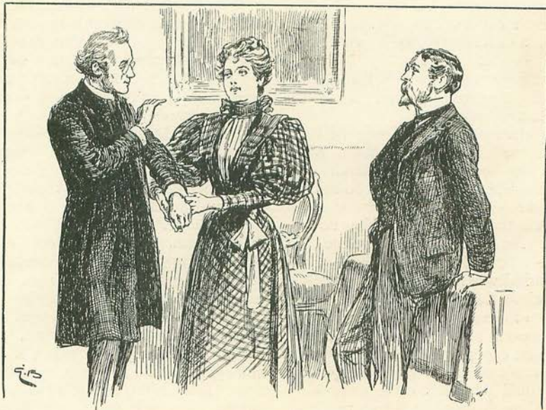
"SHE TOOK OUT THE LINKS FROM HER HUSBAND'S CUFFS."

"She is such a dear!" And she took out the links from her husband's cuffs and handed them across to me.