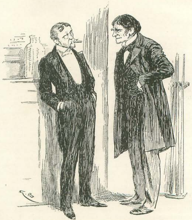
"THE MAN WITH THE BIG EYEBROWS SIDLED UP."

Fortunately, a political discussion going on a few places further down the table spread up to us and diverted attention for a moment. The magical name of Gladstone saved us. Sir Charles flared up. I was truly pleased, for I could see Amelia was boiling over with curiosity by this time.