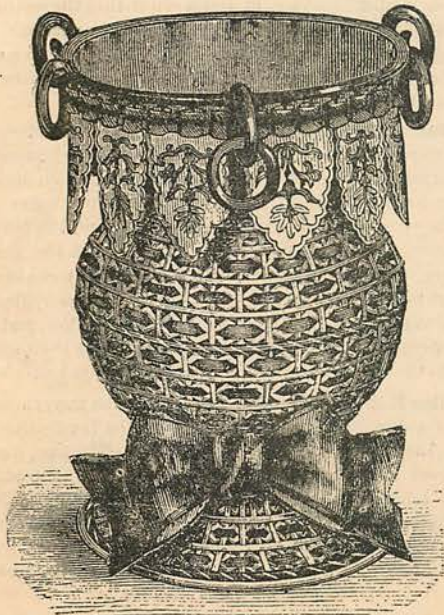
Waste Paper Basket.

THE stools used mostly at the present date are long and do not screw up; and the seat being flat allows many ways to embellish it. In our design, the center strip is of plush or cloth, worked with different colored silks to correspond with other furniture in the room. The strips at the sides are likewise of plush with a large open pattern of feather-stitch traced over the entire surface, and finished with a narrow fringe. The ends are slightly vandyked, feather-stitched in patterns, finished with a deep fringe with large silk and wool tassels between each point. Line the entire cover with canton flannel.