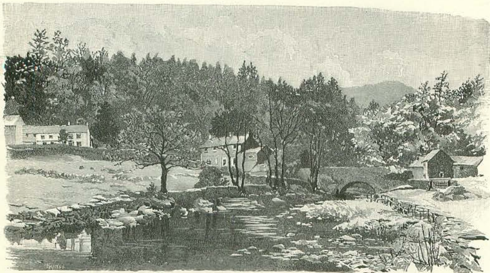
ST. MARTIN'S FROM THE MEADOWS.

not by steam power, 1 and that hiring electricity to run your errands, or the sun to paint your portrait, or steam to weave your linen, will not give sense to your message, or soul to your face, or durability to your shirt; thirdly, that I want to have, and want others to have, an entirely honest linen that can be trusted, that I can hand down to my children after me. Practically, if I wanted it I must make it for myself. I now named my project to a few select friends, and some kind ladies at once took up the cause with enthusiasm. I drove about with my wheel and gave lessons to many a sympathizer; but, after all, the wheel was its own best advocate. Wordsworth had not exaggerated its strange qualities and powers. It soothed and calmed the throbbing pulse, and the work was found to be very fascinating. Then came the first practical question, where to get wheels. I advertised, wrote to all kinds of people, and scoured the countryside. Now and then a daleswoman would drop in to report that she had heard tell of a wheel in some remote valley. Then off we started, keen as hounds when the scent lies well, but very seldom succeeded in running the prize to earth. Generally the wheels had long since been "broken down," or, if existing, were too fragile and shattered to be of any use. We labored on, but after all my efforts I could only secure seven wheels, all more or less weak. So at last the village carpenter was interviewed, and after due consideration he undertook for fifty shil-