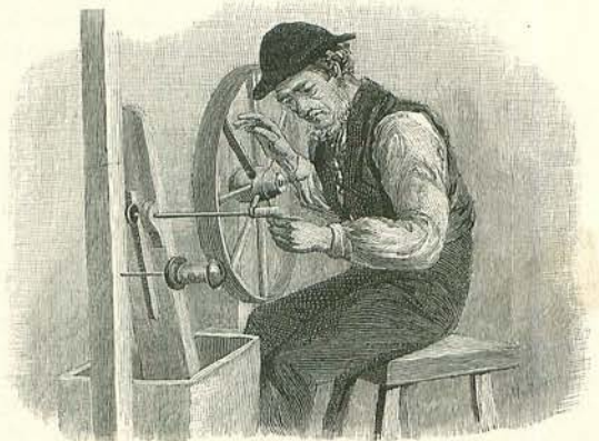
WINDING THE SPOOLS.

Carlyle says that the only way to conquer doubt and misgiving is to do the duty lying next to your hand. So I shut up my books and treatises, ignored my friends' warning letters, and set to work to get a linen-loom. Such a thing seemed as extinct as the dodo, but at last I was introduced to an old-established firm in Kendal, which took root back in the last century, but had blossomed out of late into big factories and steam-power. After consideration they thought that there was an old loom long since dead and now buried in one of the cellars; possibly its dead bones might live again; at any rate I could try it. After a search it was discovered. Very ghostly and gloomy it