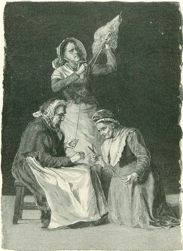
THE "THREE FATES."

produced a dreadful gouty string, all tangled lumps and knots. Everything went wrong: the wheel reversed, the thread broke, and the flax twisted itself up into inconceivable bewilderments; but when I lost patience Grannie would say in her quiet, resolute way, "Aye, but thou maun do it"; so I persevered for three days till I could and did do it. A few weeks' practice completed my education, and I felt that I could now teach others. I laid my project before Mr. Ruskin, and he wrote me word to be of good courage, that "I could not be engaged on a work of purer wisdom and benevolence." I now felt well armored against all objections, and could go forward bravely. The objectors soon came, legions of them—the hopeless creature who says, "Give me common sense," the solid friend who worships John Bright and dis-