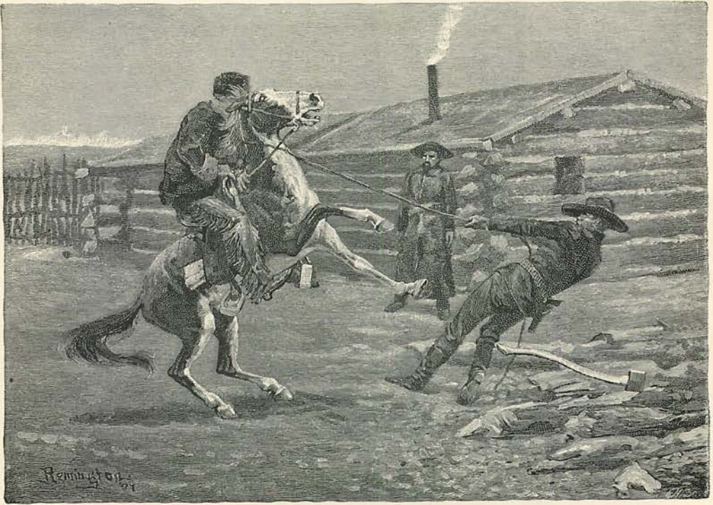
"A SHARP PRELIMINARY TUSSELE."