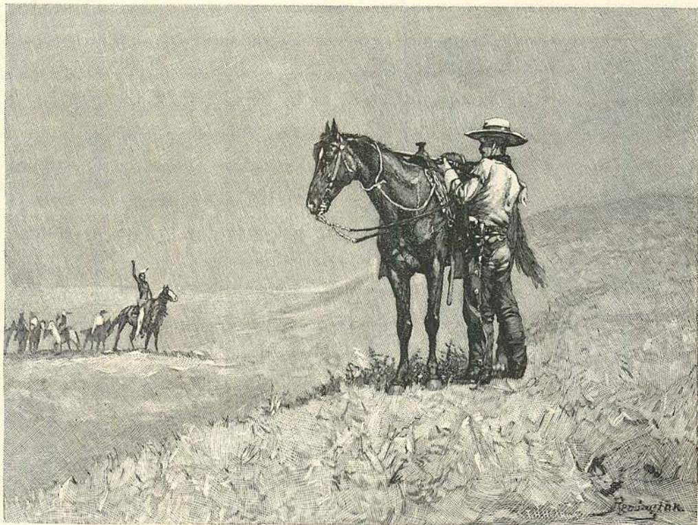
STANDING OFF INDIANS.

bottom ice did not break up, and a huge gorge, scores of miles in length, formed in and above the bend known as the Ox-bow, a long distance up-stream from my ranch. About the middle of March this great Ox-bow jam came down past us. It moved slowly,