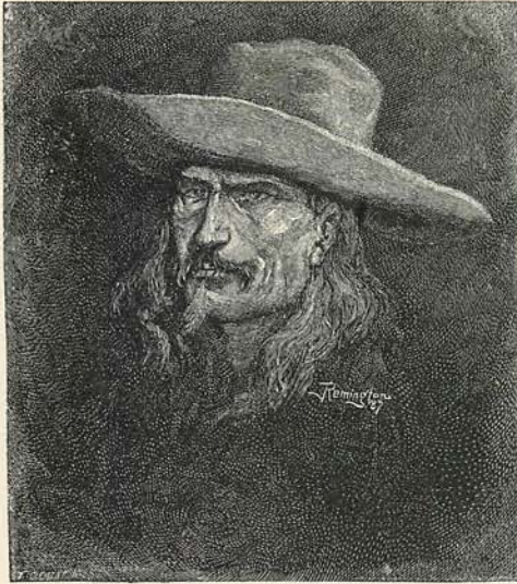
ONE OF THE BOYS.

At night the snowy, glittering masses, tossed