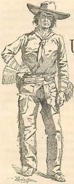
A TEXAN COWBOY.

UP to 1880 the country through which the Little Missouri flows remained as wild and almost as unknown as it was when the old explorers and fur traders crossed it in the early part of the century. It was the last great Indian hunting-ground across which Grosventres and Mandans, Sioux and Cheyennes, and even Crows and Rees wandered in chase of game, and where they fought one another and plundered the small parties of white trappers and hunters that occasionally ventured into it. Once or twice generals like Sully and Custer had penetrated it in the course of the long, tedious, and bloody campaigns that finally broke the strength of the northern Horse Indians; indeed, the trail made by Custer's baggage train is to this day one of the well-known landmarks, for the deep ruts worn by the wheels of the heavy wagons are in many places still as distinctly to be seen as ever.