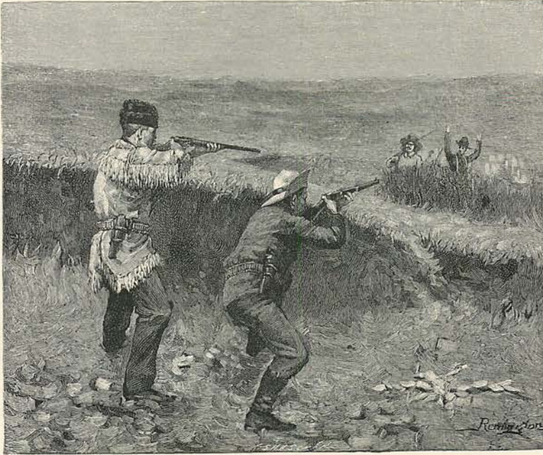
"HANDS UP!"—THE CAPTURE OF FINNIGAN.

The men we were after knew they had taken with them the only craft there was on the river, and so felt perfectly secure; accordingly, we took them absolutely by surprise. The only one in camp was the German, whose weapons were on the ground, and who, of course, gave up at