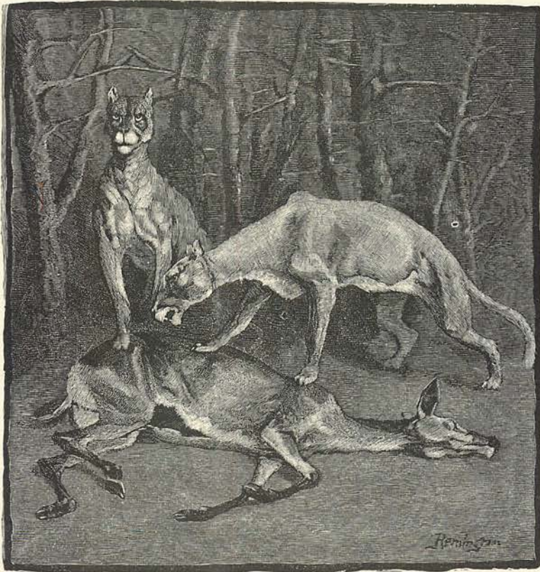
MOUNTAIN LIONS AT THE DEER CACHE.

We knew that these three men were becoming uneasy and were anxious to leave the locality; and we also knew that traveling on horseback, in the direction in which they would wish to go, was almost impossible, as the swollen, ice-fringed rivers could not be crossed at all, and the stretches of broken ground would form nearly as impassable barriers. So we had little doubt that it was they who had taken our boat; and as they knew there was then no boat left on the river, and