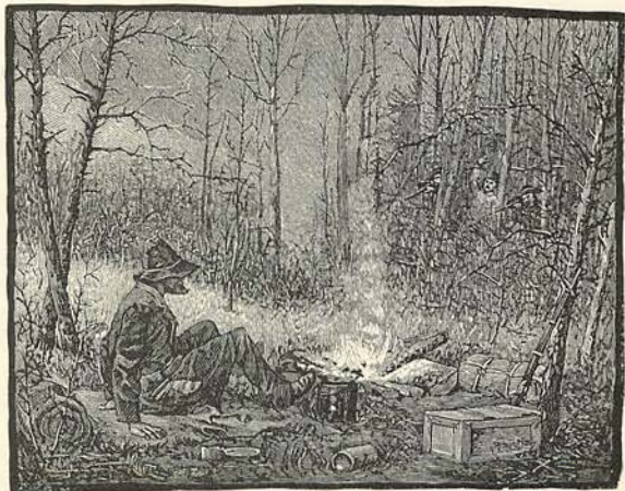
THE CAPTURE OF THE GERMAN.

During the night the thermometer went down to zero, and in the morning the anchor ice was running so thickly that we did not care to start at once, for it is most difficult to handle a boat in the deep frozen slush. Accordingly we took a couple of hours for a deer hunt, as there were evidently many white-tail on the bottom. We selected one long, isolated patch of tangled trees and brushwood, two of us beating through it while the other watched one end; but almost before we had begun four deer broke out at one side, loped easily off, evidently not much scared, and took refuge in a deep glen or gorge, densely wooded with cedars, that made a blind pocket in the steep side of one of the great plateaus bounding the bottom. After a short consultation, one of our number crept round to the head of the gorge, making a wide détour, and the other two advanced up it on each side, thus completely surrounding the doomed deer. They attempted to break out past the man at the head of the glen, who shot down a couple, a buck and a yearling doe. The other two made their escape by running off over ground so rough that it looked fitter to be crossed by their upland-loving cousins, the black-tail.