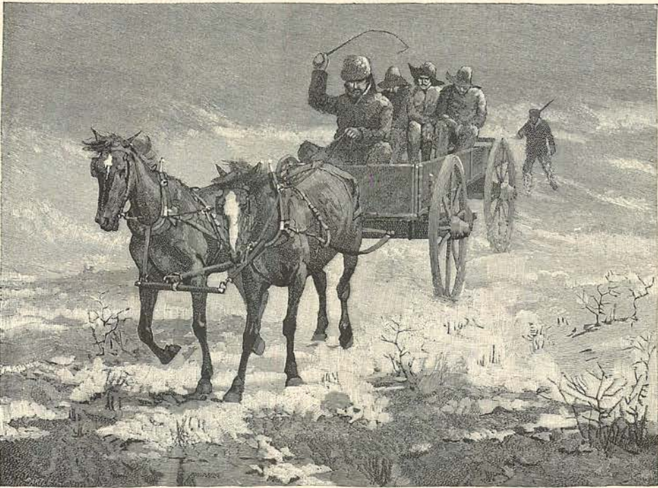
ON THE ROAD TO DICKINSON.

with them, except for the driver, of whom I knew nothing, I had to be doubly on my guard, and never let them come close to me. The little mares went so slowly, and the heavy road rendered any hope of escape by flogging up the horses so entirely out of the question, that I soon found the safest plan was to put the prisoners in the wagon and myself walk behind with the inevitable Winchester. Accordingly I trudged steadily the whole time behind the wagon through the ankle-deep mud. It was a gloomy walk. Hour after hour went by always the same, while I plodded along through the dreary landscape—hunger,