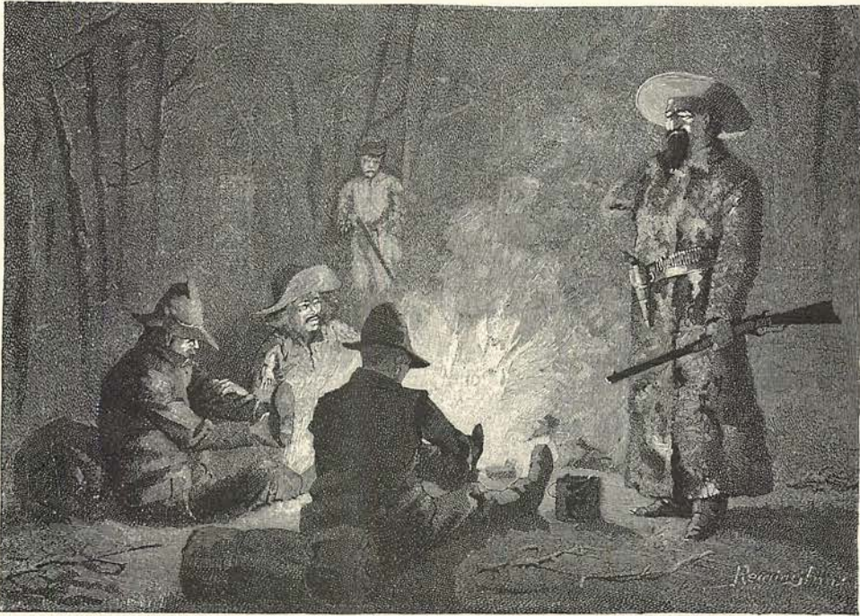
"TAKE OFF YOUR BOOTS!"

let his rifle drop and held his hands up beside his head.