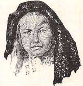
WIFE OF ZELE.