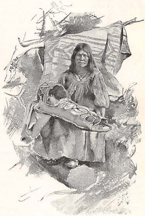
APACHE MOTHER AND INFANT.

Only in their dances do they excel the physical energy put forth in their gambling plays.