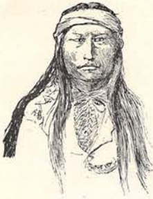
NACHEZ, SON OF COCHISE.

yet. Could this old sage of the sandy deserts concentrate the salient points of his life into a volume, it would rival the tales of Daniel Boone or Kit Carson.