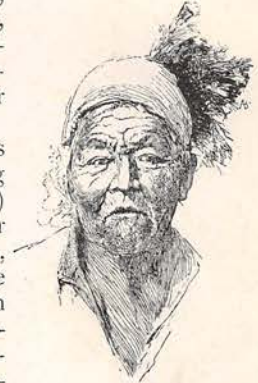
OLDEST APACHE ON THE RESERVATION.

Once the Yuma and Mojave bands held high rank as warriors among the Apache tribe, but their country being easy of access, they were the first to succumb to civilization, and have gone a long way on that road of extinction which is marked out to those peculiarly tempered savages who can absorb only