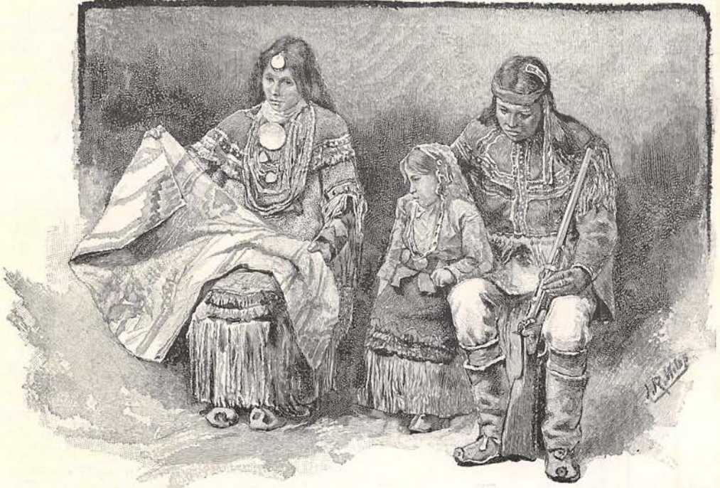
APACHE FULL DRESS.

had gone through all the processes of his trial, there hung over his head a three-years' sentence in the penitentiary at Alcatraz within the Golden Gate. Even death has been meted out to offenders by Indian juries. A guard-house inclosed less refractory criminals, and through one of its windows peered the face of an Indian sentenced for life.