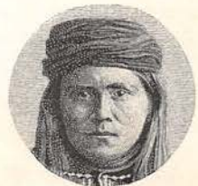
T'ZOE, OR "PEACHES."