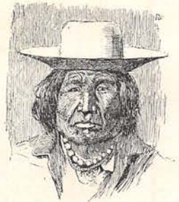
HEAD WAR-CHIEF OF CHIRICAHUA.

No drink-loving old toppers ever enjoyed their liquor so much as have the Apaches whenever they could procure it, a vice, however, that is rapidly subsiding as the tribes are concentrated at agencies more directly under the eyes of watchful authorities. Mezcal , made from that plant by the Mexicans, found its way in days gone by, when population was scattering and the laws lax, into Apache maws with every trade and deal-