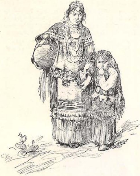
APACHE SQUAW AND CHILD.

the entire village is summoned to the proceedings, which generally mean an execution. In carrying these on the victim is stripped to her waist and then tied up by her thumbs with strong thongs, her toes barely touching the ground. All of their devilish energies are now bent on extorting a confession from the wretch. Any of those who have had any misfortune, however remote, imaginary, or real, are at perfect liberty to flay the supposed witch with mezquite or willow switches until she faints from exhaustion, or terror and weakness forces a false confession in the vain hope of obtaining relief from her terrible condition. If she will not thus please them, the whipping is kept up until the executioners themselves are exhausted, when one by one they leave her to die, which results unless she be lucky enough to liberate herself from the thongs after the last one has departed. Should they wring a confession from her, she is beaten to death with stones and sticks, and all of her property burned, even to her rude house and ruder utensils.