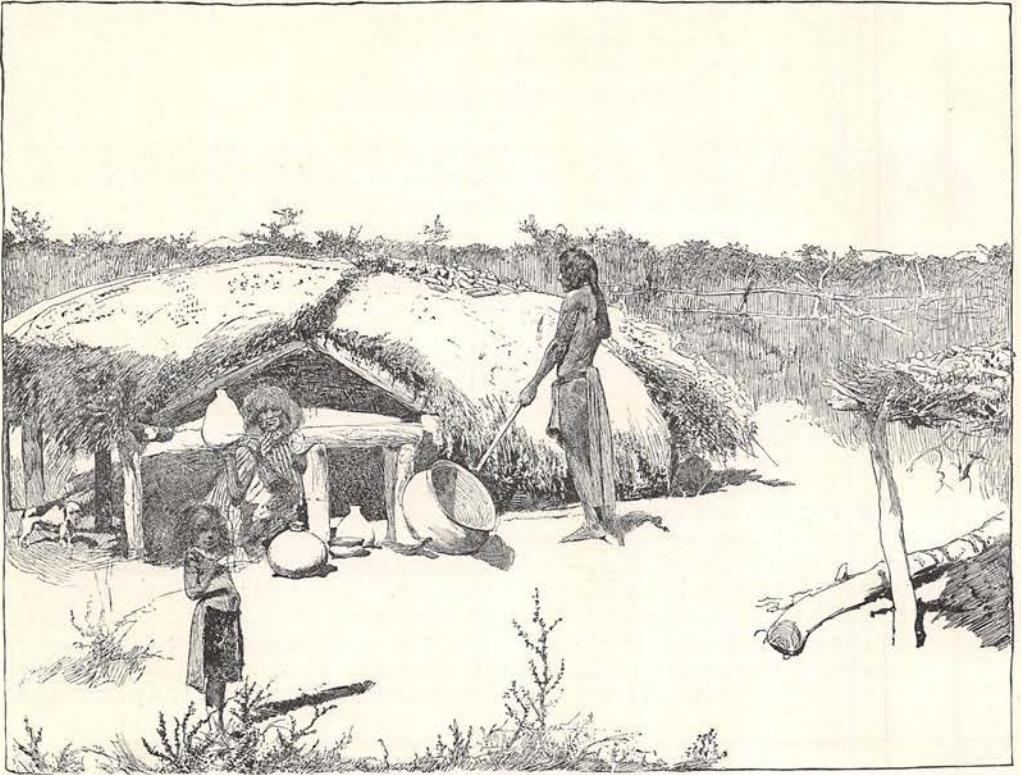
YUMA APACHE AND FAMILY BUILDING A HOUSE.

alongside of de Vaca much to the detriment of the former. In fact, it was explained to me that Cabeça de Vaca, meaning a cow's head, was but the Spanish translation of the Apaches' name for the first soldier among them, and was thus given because the feast of the cow's head was then held in reverential esteem.