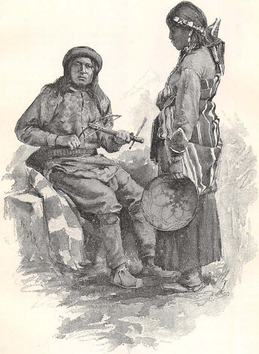
APACHE FIDDLER AND MAIDEN.

named and the Tontos, a clan of central Arizona. Among the Apaches, men are never accused of this crime, but, at extremely long and rare intervals, some luckless squaw in a village that has seen more than its share of