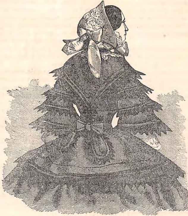
THE VENITIAN BASQUE.