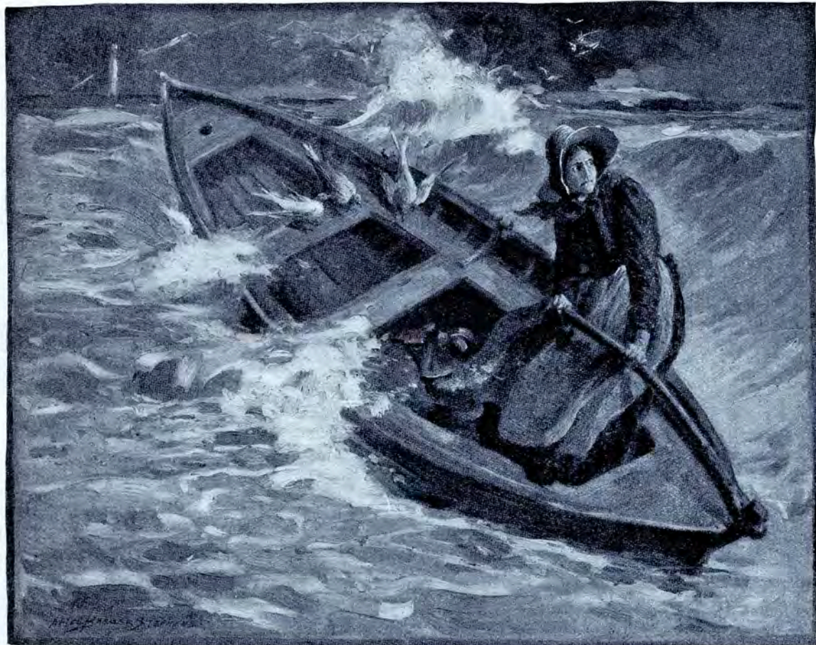
"Things were gettin' awfuller and awfuller every instant"